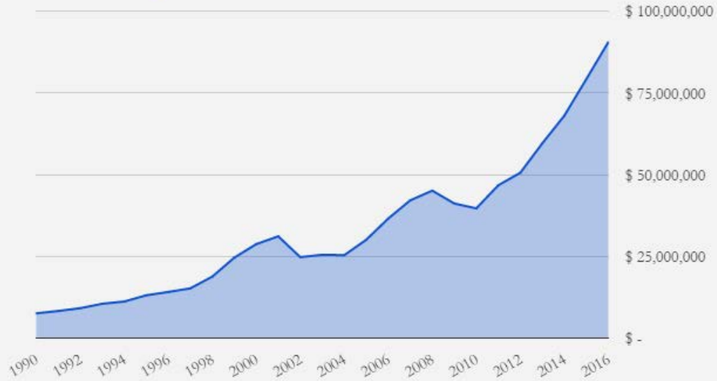
Total Hotel Occupancy Taxes

Revenues are expected to double between 2024-2028