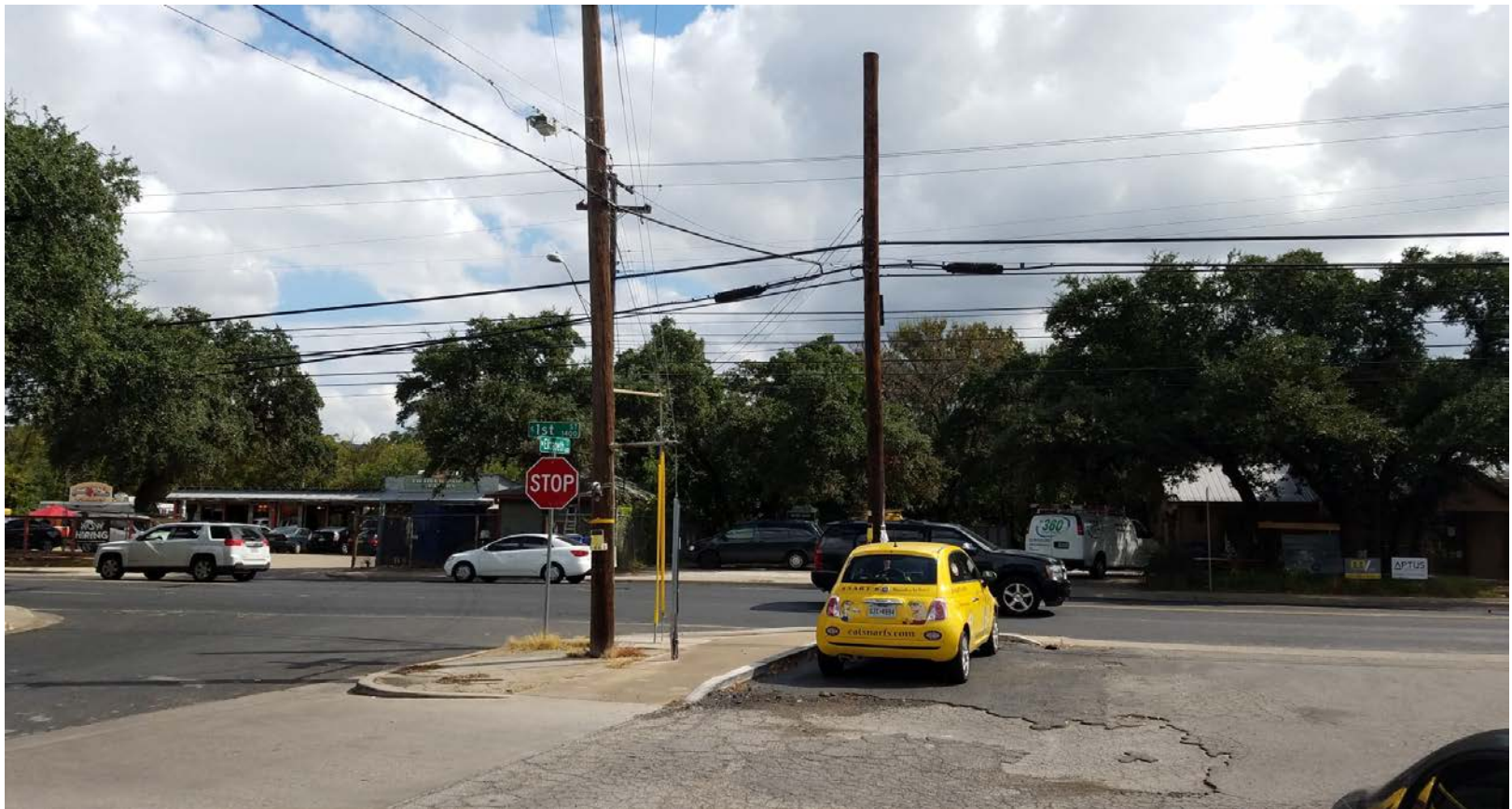
Image in the direction of the Texas School for the Deaf from the Snarf's Sandwiches site