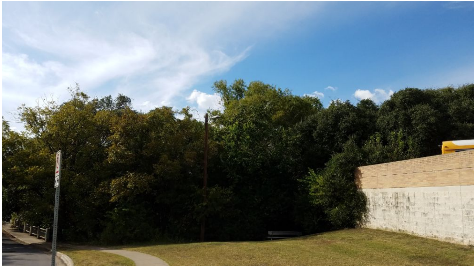
Image in the direction of the Snarf's Sandwiches site from the Texas School for the Deaf property