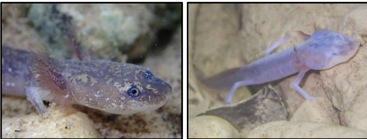
Figure 1. A) Eurycea sosorum and B) E. waterlooensis from Upper Barton Spring.

Since the description of E. sosorum in 1993, there were occasional sightings of juveniles of a morphologically distinct salamander at Barton Springs that appeared much more similar to the Texas Blind Salamander ( Eurycea [ Typhlomolge ] rathbuni ) than to E. sosorum (Hillis et al. 2001). This second form was described as a new species – Eurycea [ Typhlomolge ] waterlooensis , The Austin Blind Salamander – in 2001 (Hillis et al. 2001) (Fig. 1B).