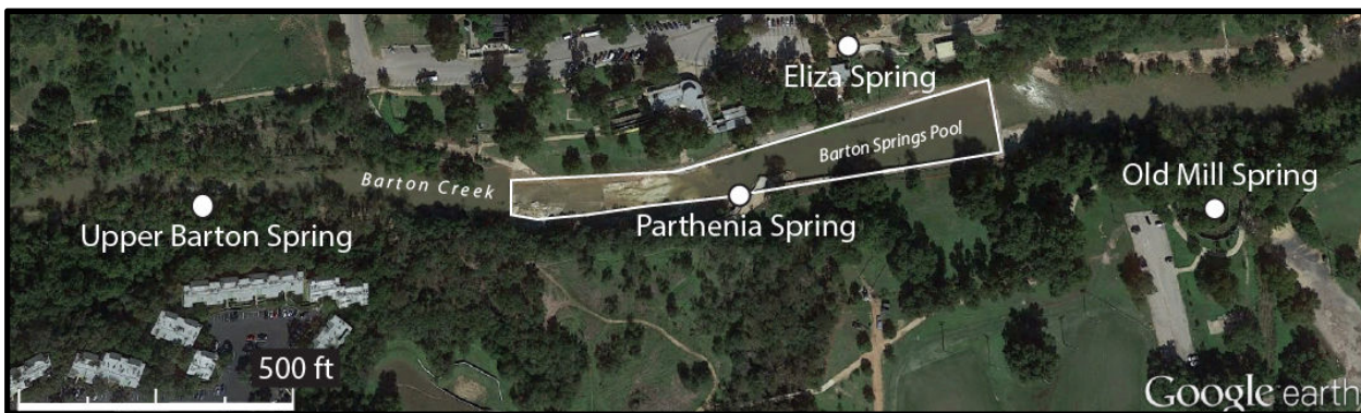
Figure 3. Aerial view showing the location of the four springs of the Barton Springs complex.

Additional data on habitat characteristics have been collected since 2002. These data include: percent of the survey area comprised of different types of substrate (e.g., bedrock, boulder, cobble, gravel, sand, silt/sediment); sediment depth; percent bryophytes, aquatic macrophytes, leaf litter, and algae; and relative abundance of other vertebrates and invertebrates. In 2003, the quadrat-transect sampling method was changed to a “modified drive method” where divers oriented themselves perpendicular to the current and moved upstream in parallel, searching through and moving all non-embedded substrate downstream (City of Austin 2013). This creates a moving strip 6–10” wide of open space free from cover. Salamanders that cross the line downstream