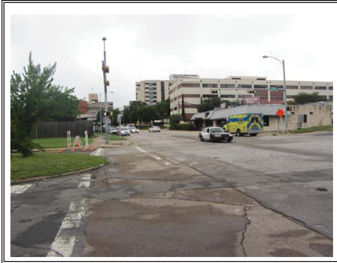
Subject's Red River position on the south side of University Medical Center Brackenridge