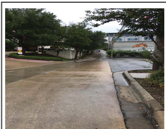
Access to hospital and parking garage from Red River