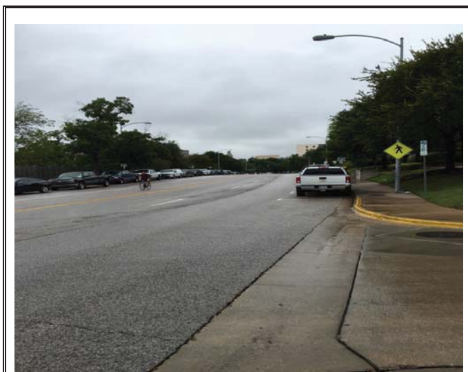
Facing north; subject on the right