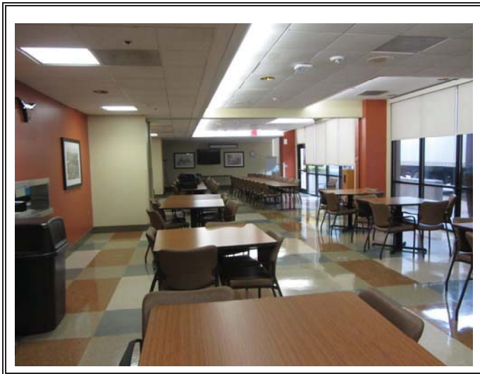
First floor dining room