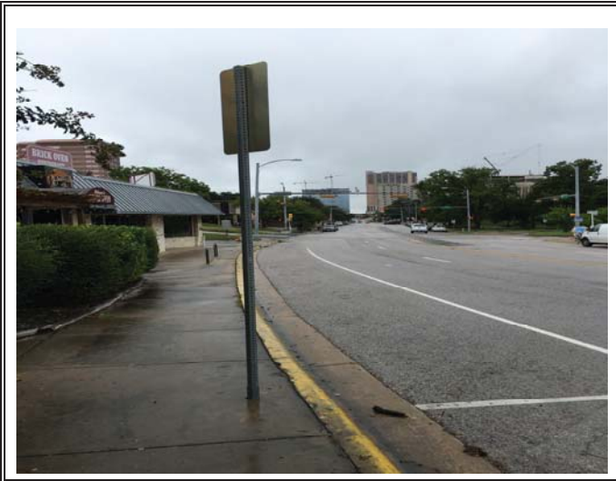
Facing south; access from Red River