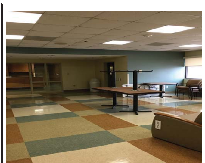
Typical patient dining room