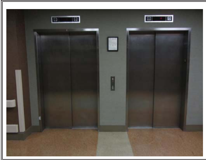
Typical passenger elevators