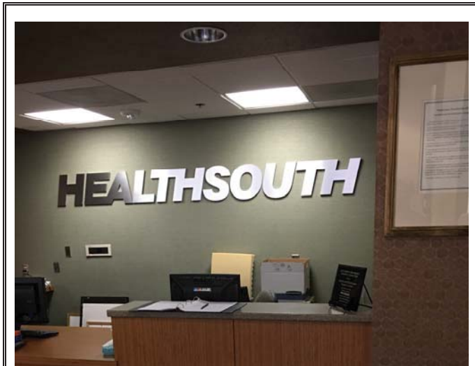
Lobby associated with main entrance to the building