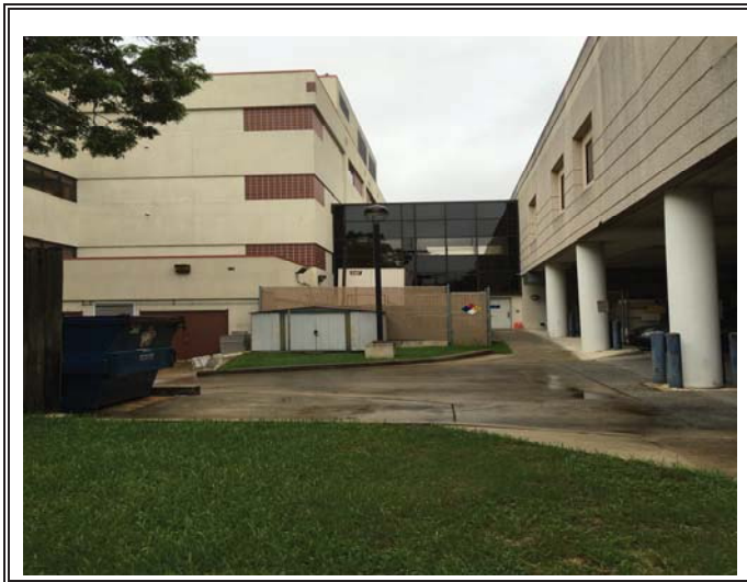
North elevation of hospital and elevated walkway to Brackenridge Hospital