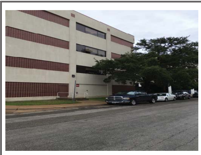
East elevation of hospital