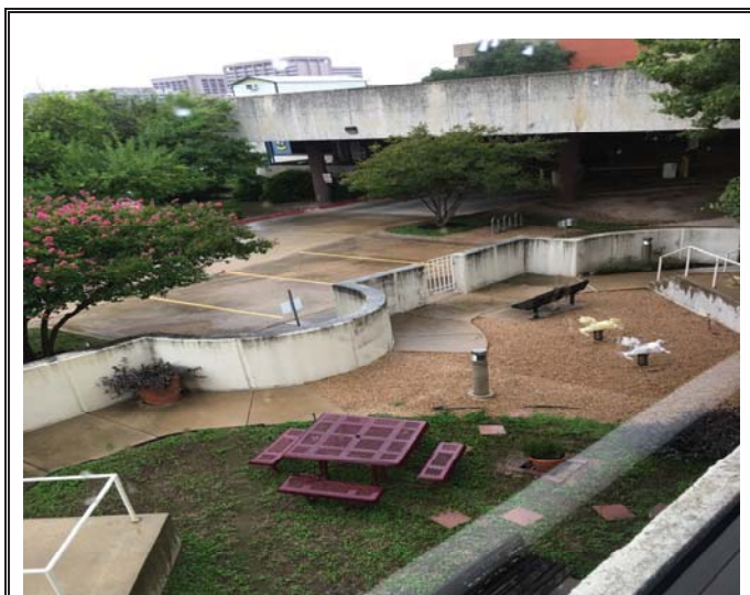
Garden/courtyard on west side of the building