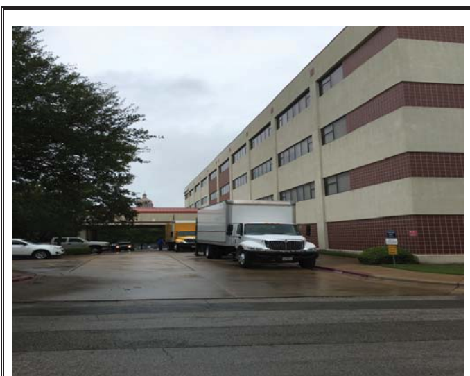
South elevation and main entrance