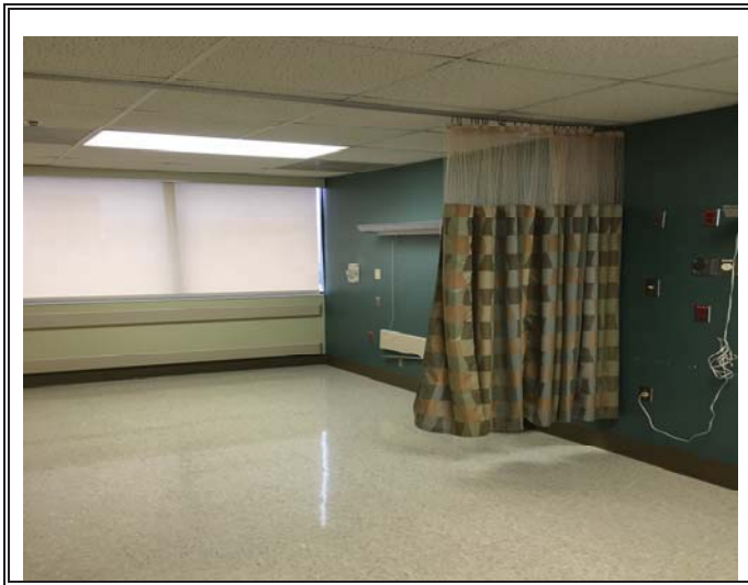
Typical patient room