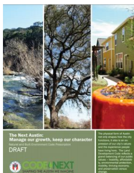
Natural & Built Environment March 2016

While the CodeNEXT team is drafting and reviewing code, the project team will issue and organize community conversations and feedback on some of the most challenging and important topics that the code will address. The primary tool for prompting and organizing these conversations is a series of four code "Prescriptions" – one on each of the topics below.