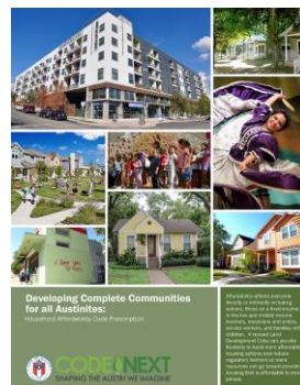
Household Affordability May 2016