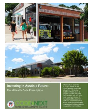
Fiscal Health September 2016

For more information about CodeNEXT, visit the project website: www.austintexas.gov/codenext .