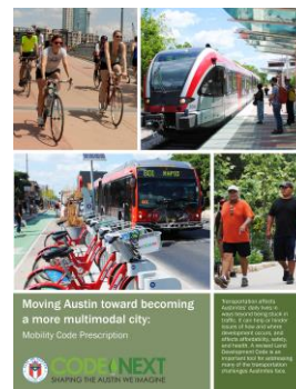
Mobility July 2016