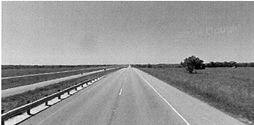
4829 US-183 Lockhart, TX 78644