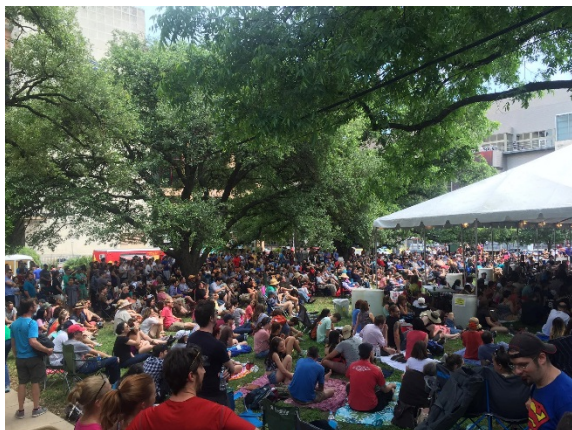
Figure 4: The O. Henry Pun Off has received media attention from all over the world.