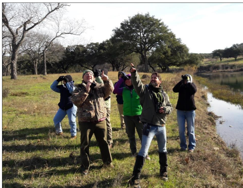
Christmas Bird Count with Travis County biologists.