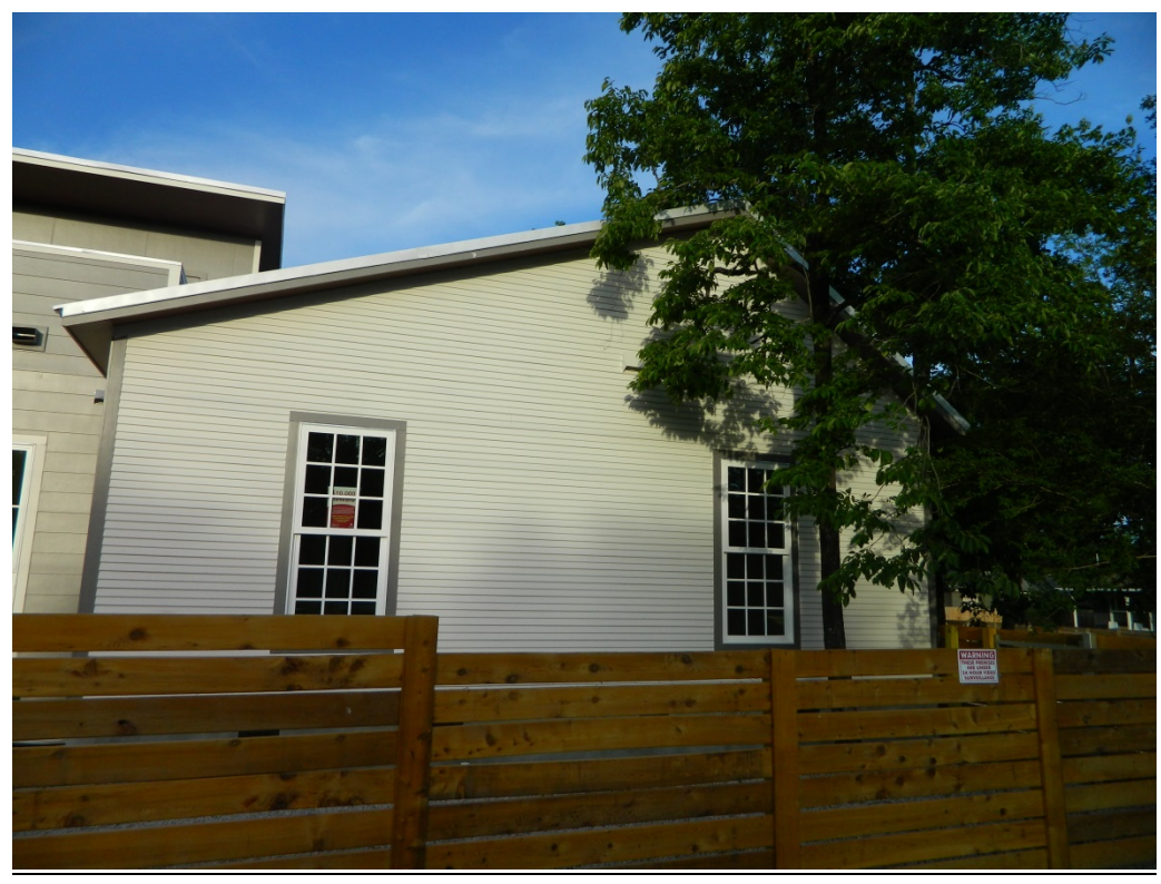
A.9 - 6