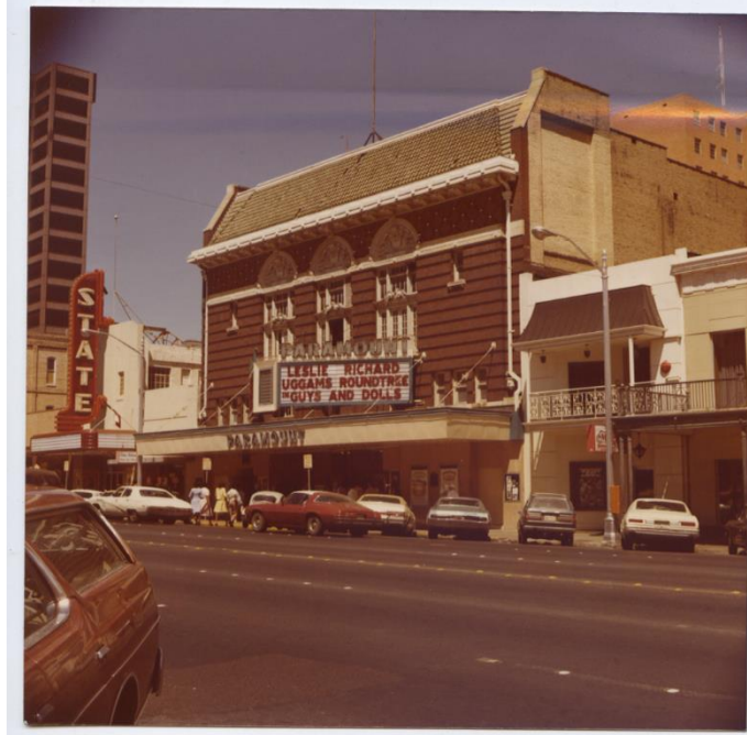
The Paramount in a transitional phase