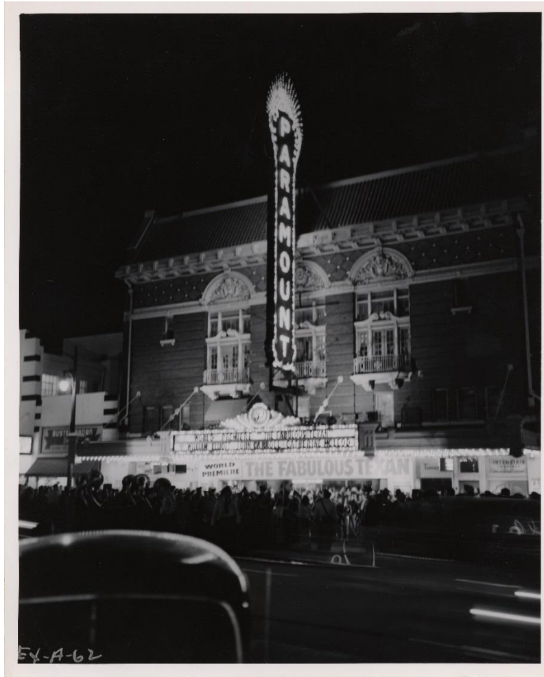
The Grande Dame of Congress Avenue – The Paramount Theatre.