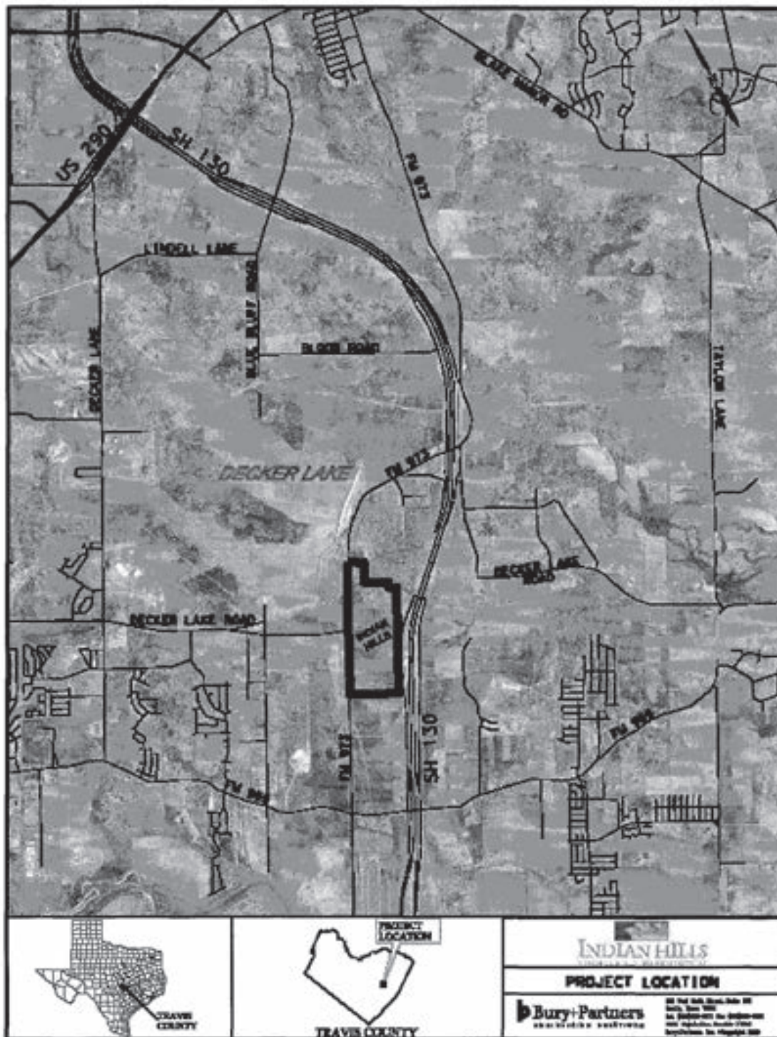
TABLE II-A PID Boundary Map