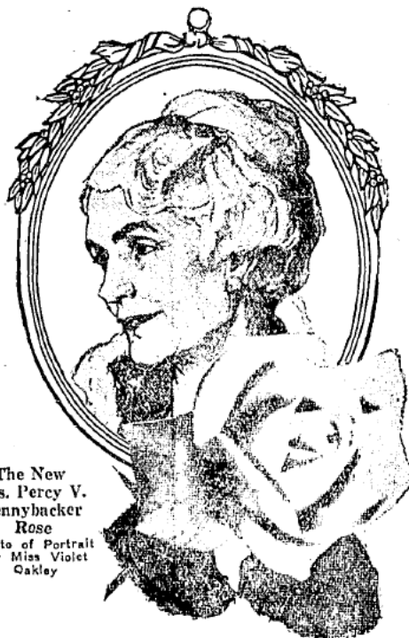
Photo of Portrait By Miss Violet Oakley