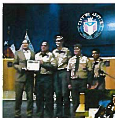
Encouraging young Boy Scouts in District 6