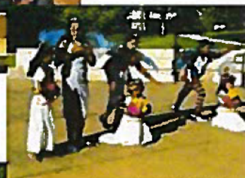
Supporting District 6 local neighborhoods—Avery Ranch Festival of Colors