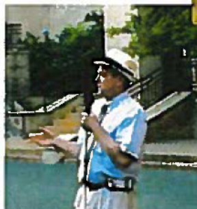
Speaking at American Legion of Texas Boys State