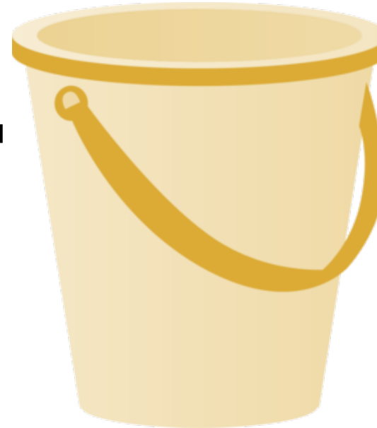
Connected and Autonomous Vehicles