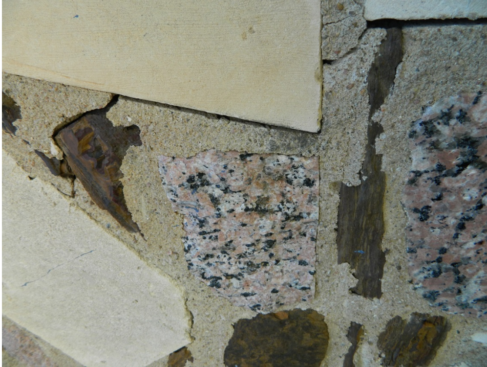
Detail of stonework, showing polished pink granite