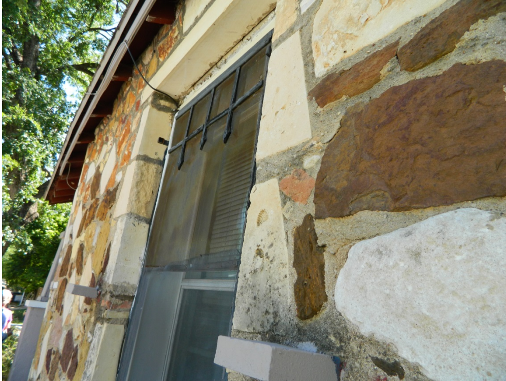
Stonework at window openings