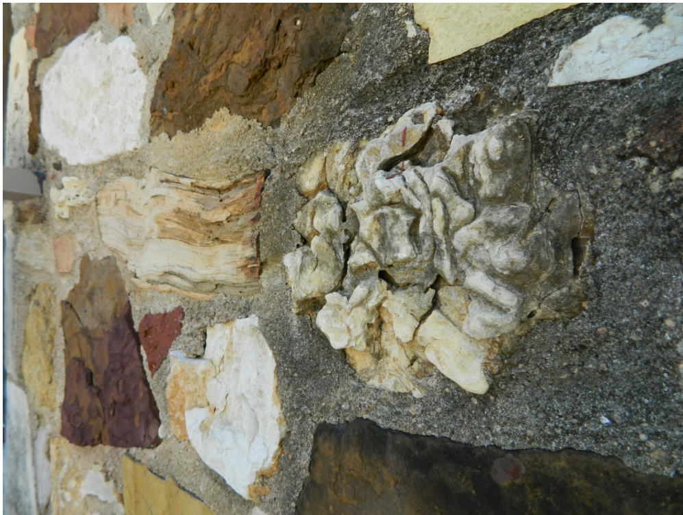
Detail of stonework, showing petrified wood and other exotic stone