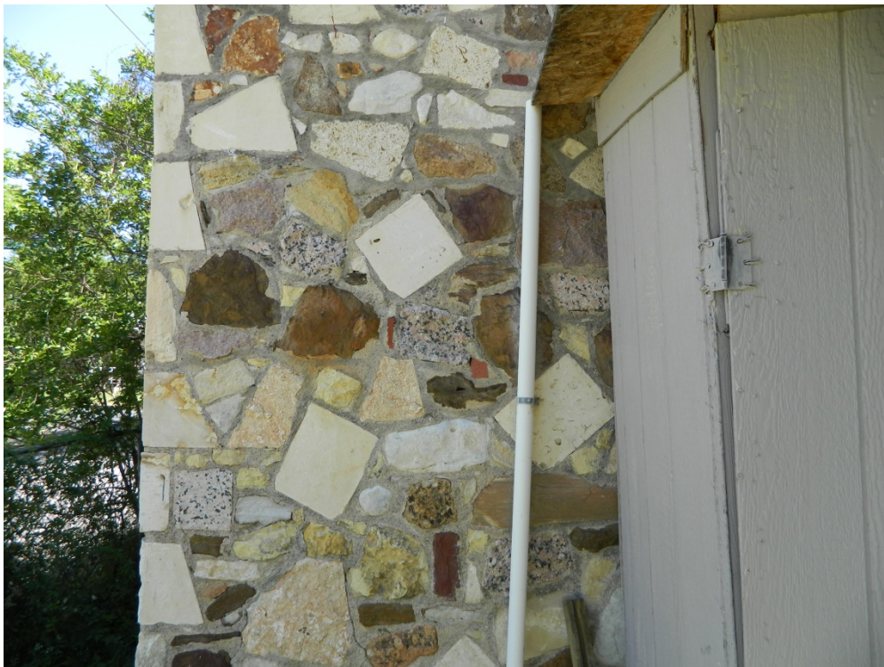
Detail of stonework showing the different types of stone used.