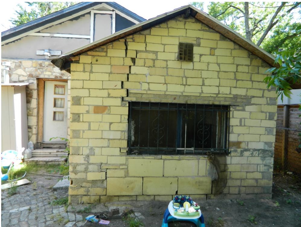
ca. 1946 tile addition on the rear of the house