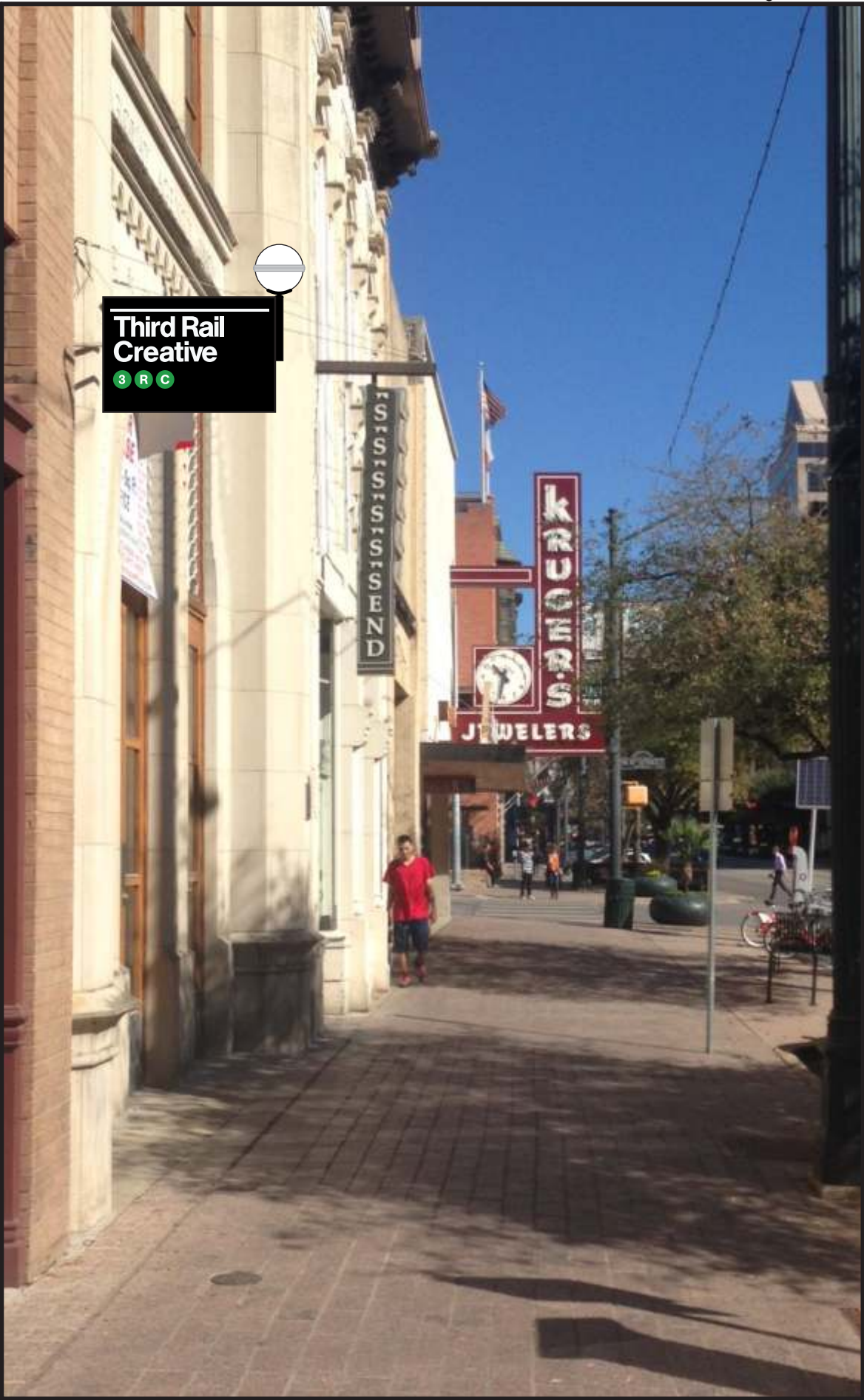
PHOTO SURVEY - PROPOSED