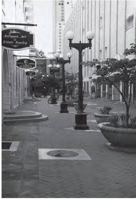
Streetlights set to the scale of the pedestrian create a comfortable space where people feel safe.

THIS NEW TEXT AND FOTOS INTENDED TO BE REFORMATTED AFTER A TEMPLATE IS SELECTED, OR ARE WE USING ORIGINAL FORMAT?