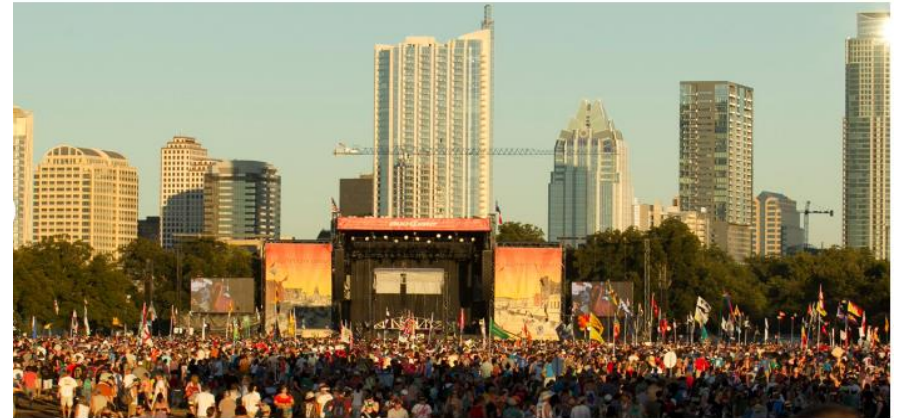
View from ACL Fest: left, October 2004. Right, October 2012