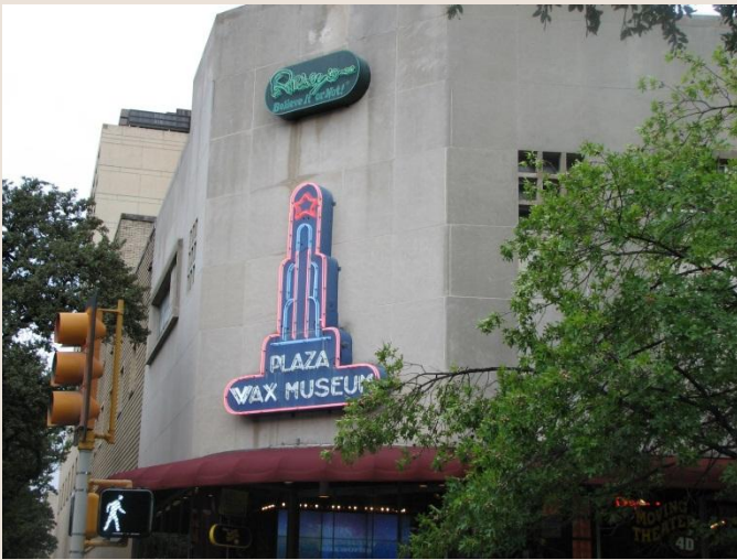
Wall-mounted signs are typically mounted parallel and fastened to the wall of a building above the primary entrance. This unique sign complements the building it is attached to.

Building-mounted signs, such as projecting signs or wall-mounted signs, play a significant role in complementing—or potentially detracting from—the character of a historic building and the surrounding district. Appropriate use of these sign types can help reinforce the historic character of the streetscape and the buildings they are intended to serve. Projecting signs are typically oriented towards pedestrians, making them most suitable to commercial or mixed-use districts with a more urban character.