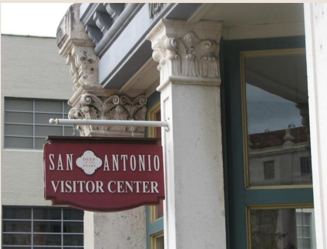
Projecting signs are generally two-sided signs suspended from the building and mounted perpendicular to its face.