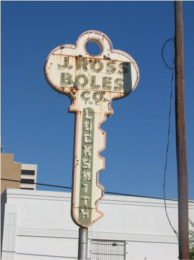
Historic freestanding sign in Downtown San Antonio.

Freestanding signs are not attached to a building, and may include information on either or both sides. Small-scale freestanding signs can help reinforce the historic character of a residential buildings and streetscapes that have been adapted for office and retail uses, while providing necessary identification for businesses.