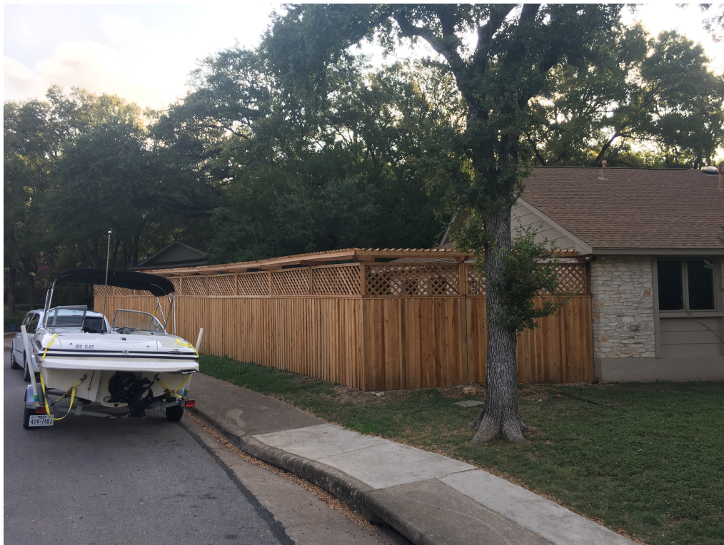
Recent photos of the new fence at 2801 Down Cove