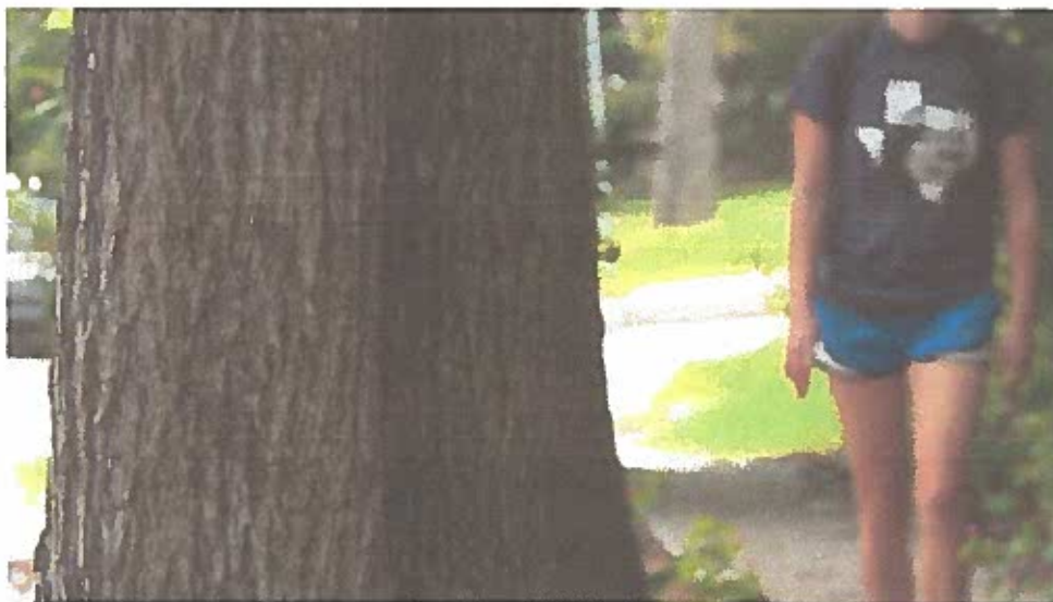
A student walks on the sidewalk across from Eastwoods Neighborhood Park, where another UT student says she was punched in the back of the head Wednesday, Sept. 27, 2017.

Published: September 27, 2017, 1:24 pm | Updated: September 27, 2017, 11:33 pm