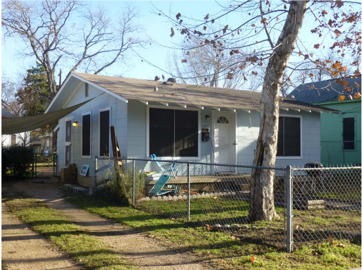
Primary (south) façade and west elevation of 1414 E. 3 rd Street.