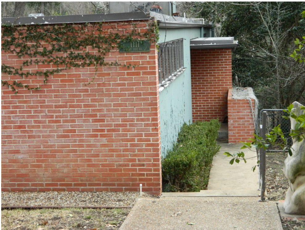
View of the west elevation of the house from 31 st Street.