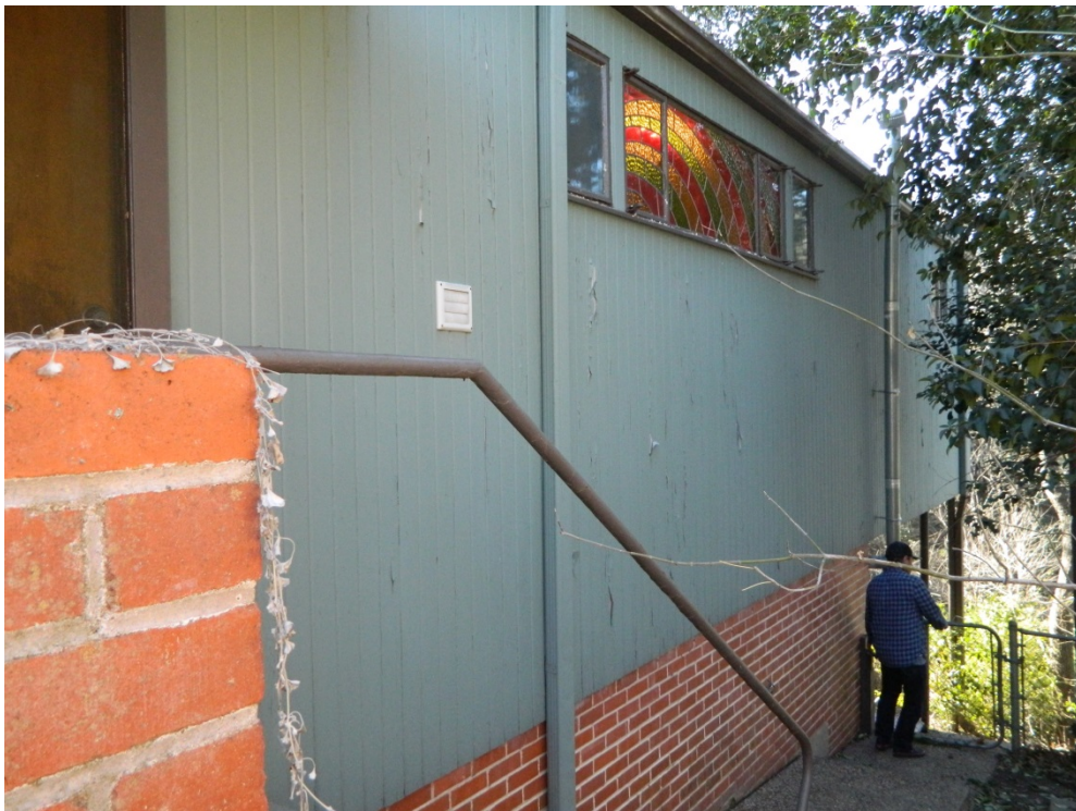
West elevation to cantilevered section over Shoal Creek