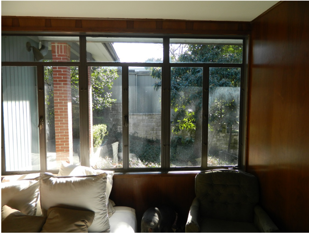
View from the interior towards the back of the east courtyard