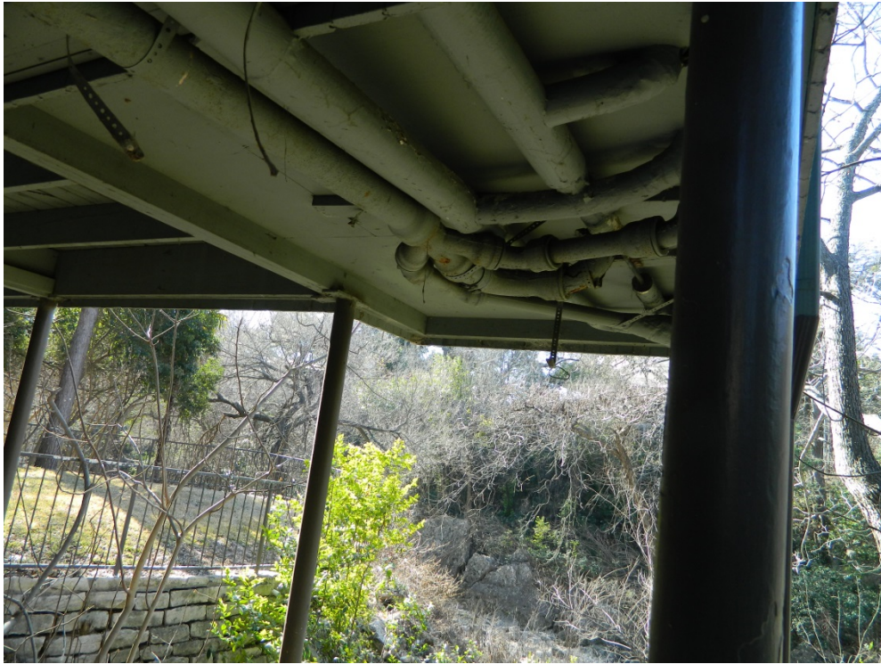
Underside of cantilevered section with Shoal Creek in the background