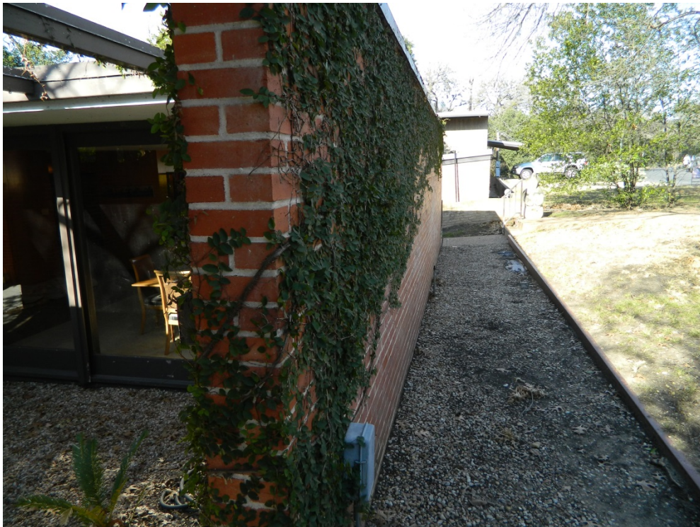
View looking west along front brick wall