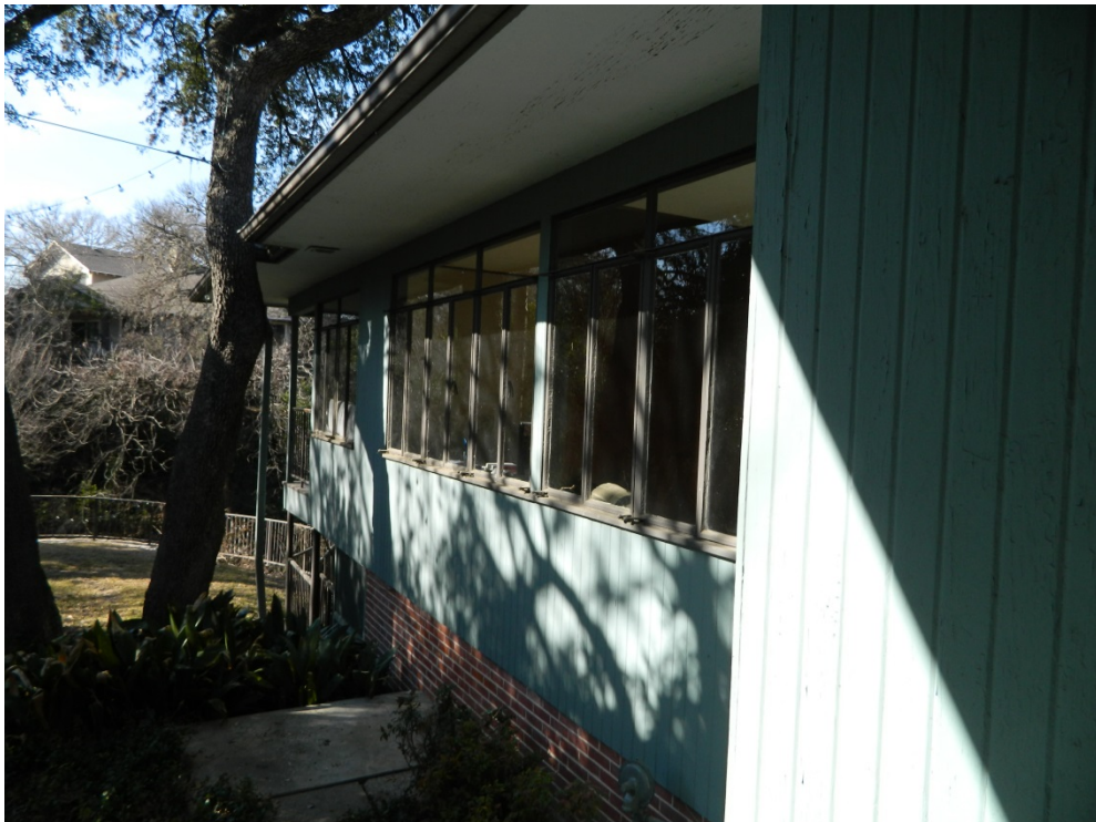
View of east elevation