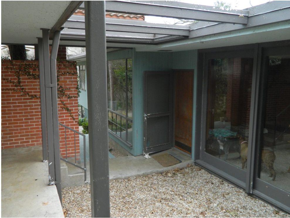
View of interior courtyard and carport (east elevation)