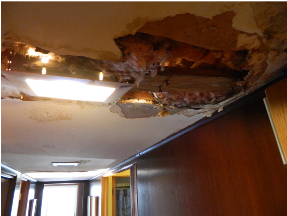
Water damage in the hall ceiling