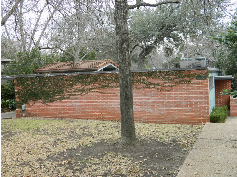
View of the house from 31 st Street