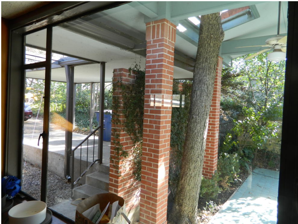
View from interior toward the courtyard and carport