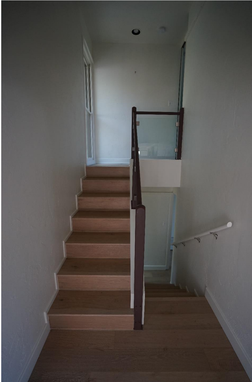
VIEW FROM FOYER TO SPLIT LEVEL BEDROOMS