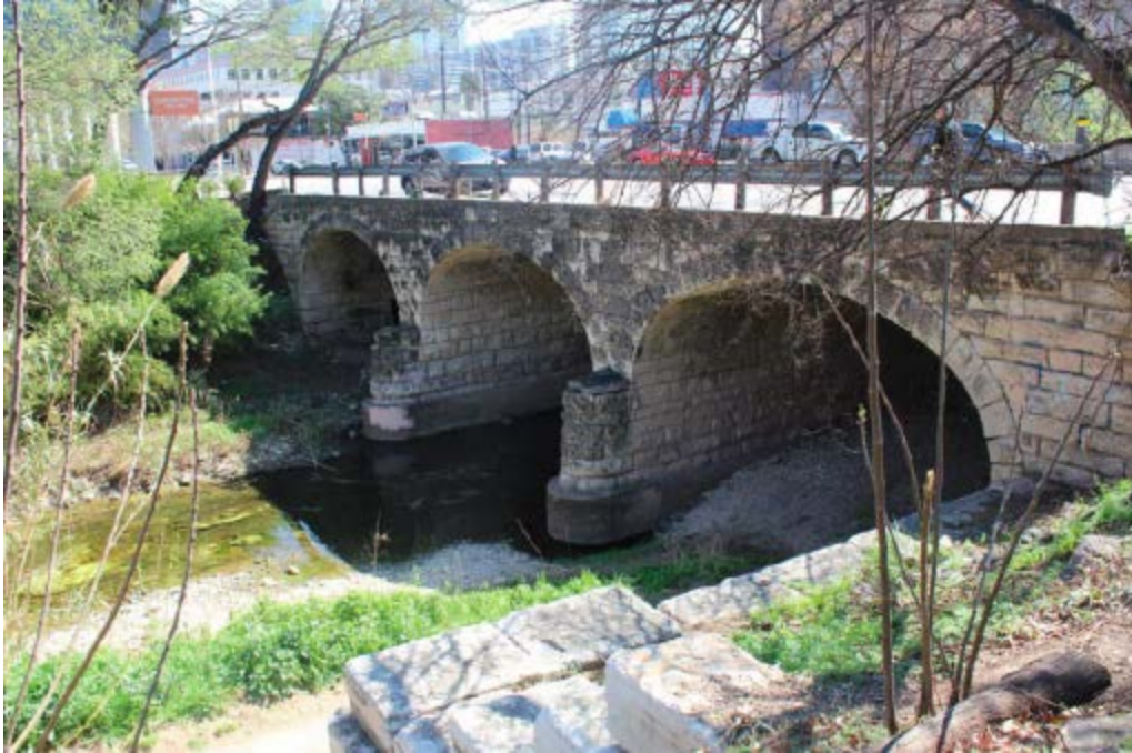
West 6th Street Bridge, Shoal Creek, Austin, Texas

Thank you to the Texas Historical Commission as well as the Conservancy's Historic Bridge Committee for your support of this project.