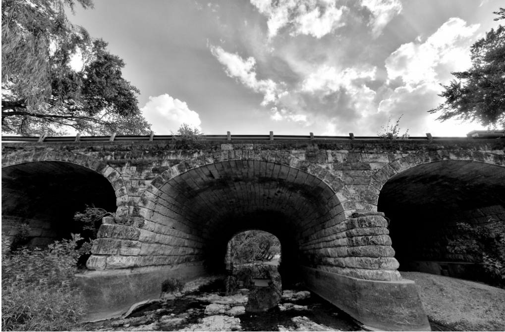
West 6th Street Bridge, Shoal Creek, Austin, Texas

Did you know that the West 6 th Street Bridge over Shoal Creek is older than the Texas State Capitol Building?