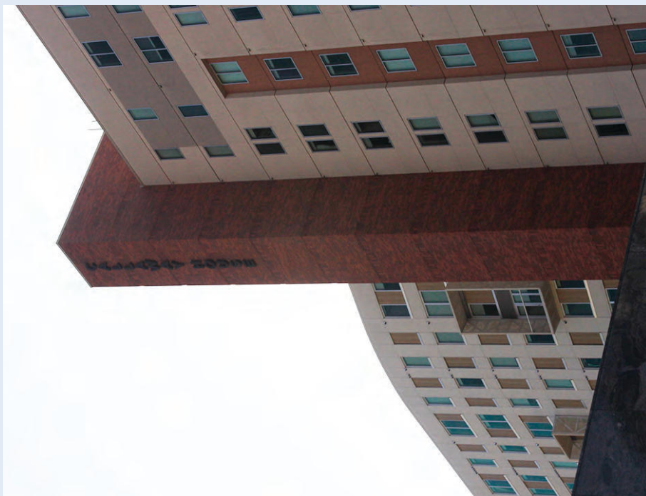
EAST ELEVATION - High Level Sign, Non-Illuminated Letters.