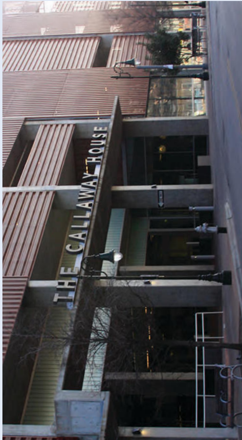
NORTH ELEVATION - Low Level Sign, Illuminated Channel Letter Identity Sign