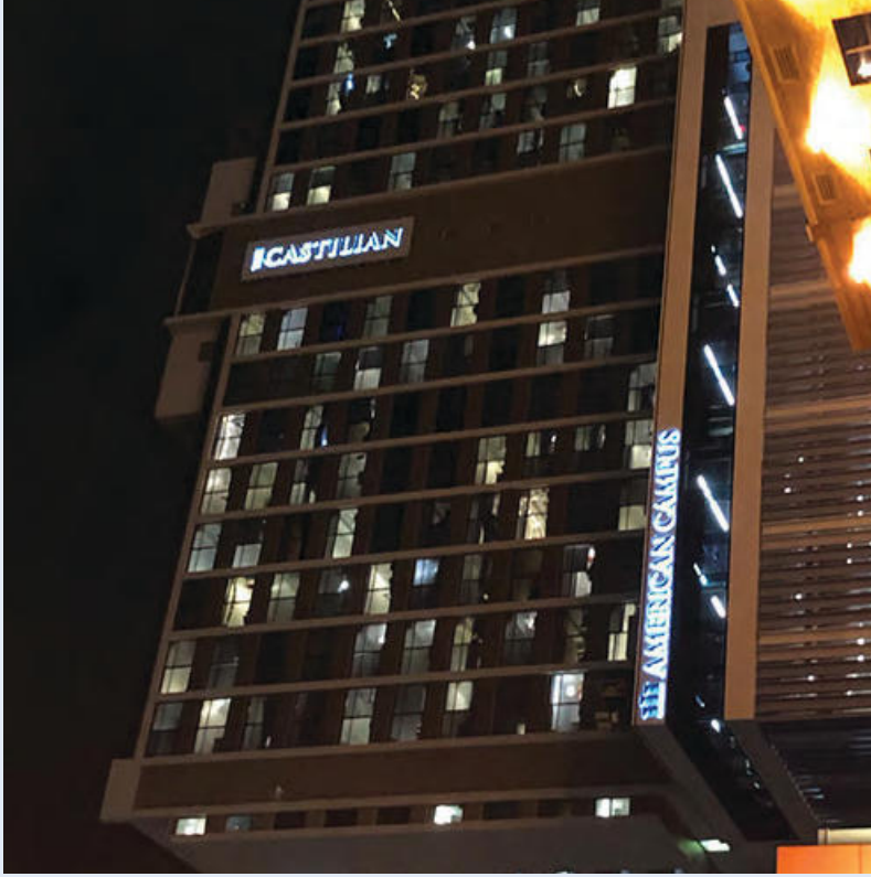
EAST ELEVATION - High Level Sign, Illuminated and Mid Level Sign, Illuminated