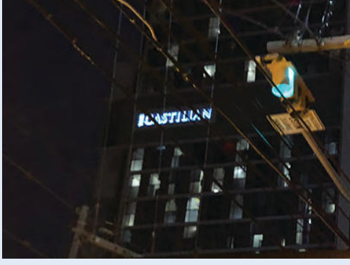
WEST ELEVATION - High Level Sign, Illuminated

Babendure Design Group 8140 Walnut Hill Ln. #950 Dallas, Texas 75231 214.265.1960 214.265.5552 (fax) www.babendure.com