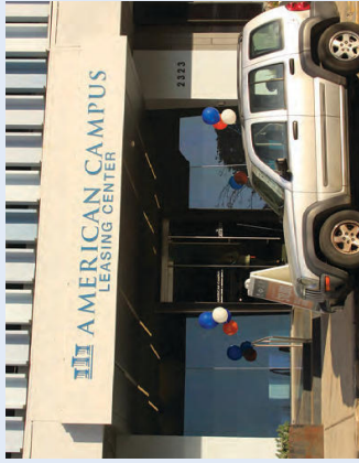
Low Level Sign - Illuminated Identification Sign located at the Leasing Center entrance. on the West side.