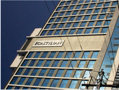
WEST ELEVATION - High Level Sign, Illuminated