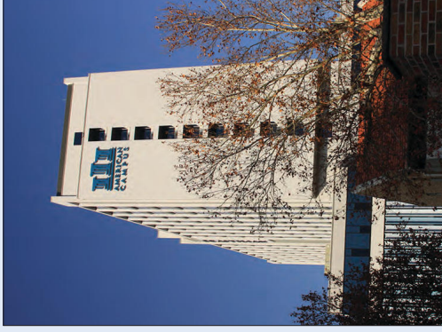
SOUTH ELEVATION – High Level Sign, Illuminated

Babendure Design Group 8140 Walnut Hill Ln. #950 Dallas, Texas 75231 214.265.1960 214.265.5552 (fax) www.babendure.com