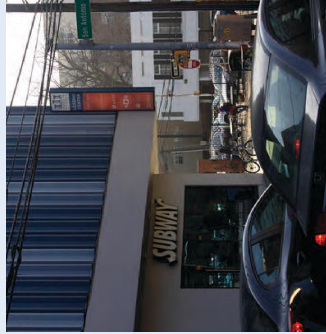
Low Level Sign - Illuminated Flag Sign at the northwest corner.