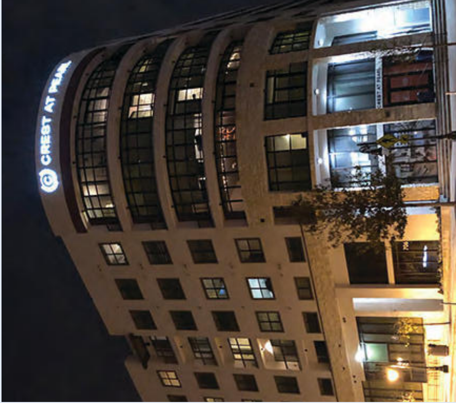
SOUTHEAST ELEVATION - High Level Sign, Illuminated.