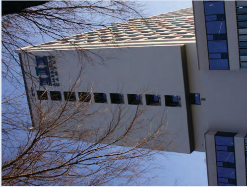
NORTH ELEVATION – High Level Sign, Illuminated