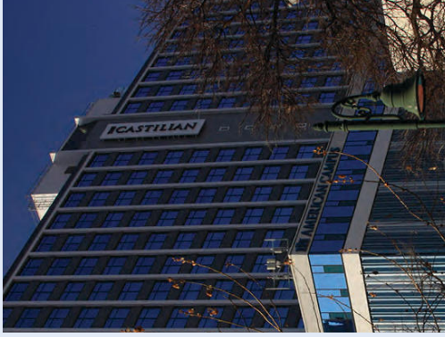
EAST ELEVATION – High Level Sign, Illuminated and Mid Level Sign, Illuminated