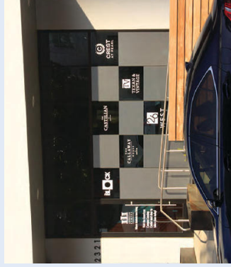
Low Level Sign - Non-Illuminated vinyl applied to glass in checkerboard pattern.