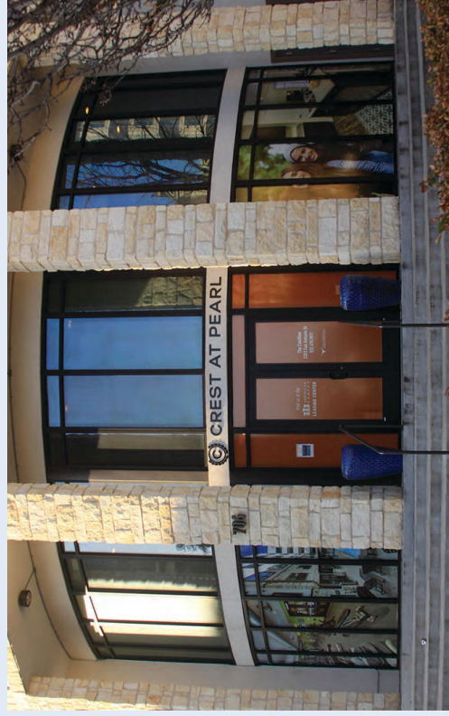
SOUTHEAST ELEVATION - Low Level Sign, Non-Illuminated