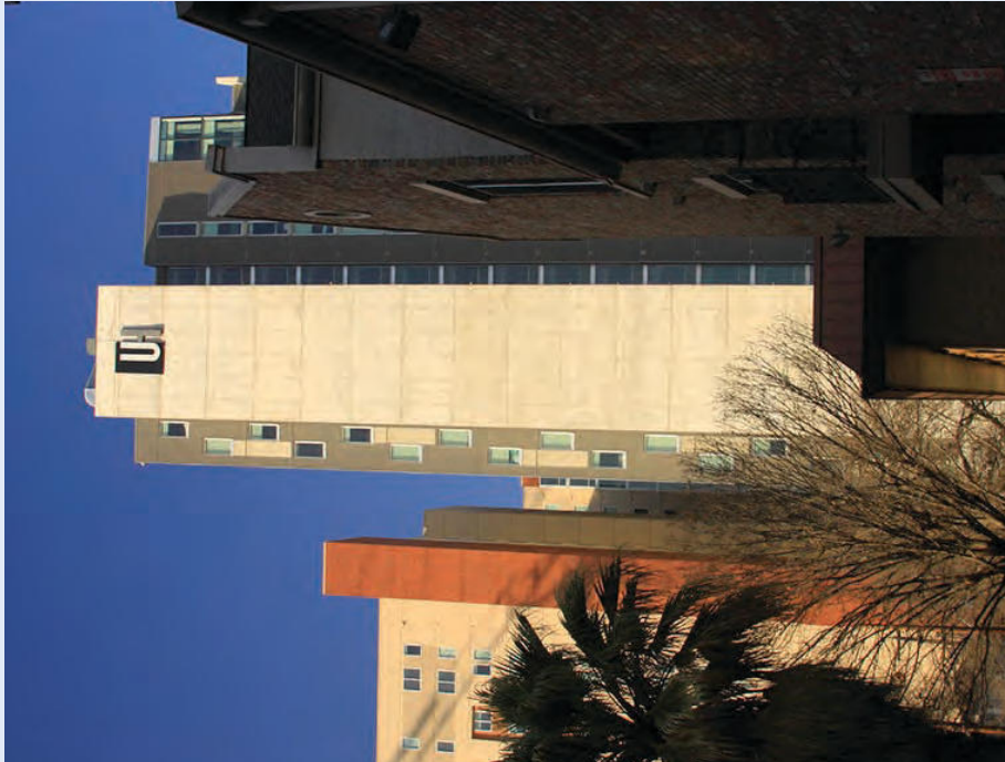
SOUTH ELEVATION - High Level Sign, Illuminated Identity.

University House 2100 San Antonio Street