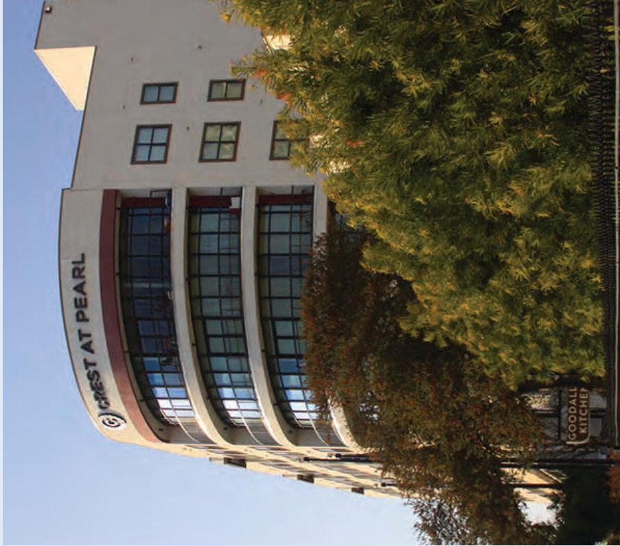
SOUTHEAST ELEVATION - High Level Sign, Illuminated.