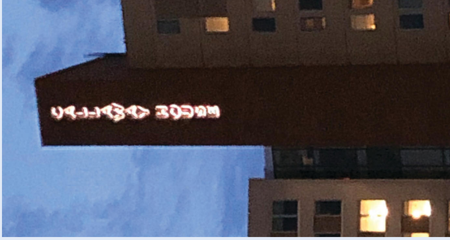
EAST ELEVATION - High Level Sign, Non-Illuminated Letters.