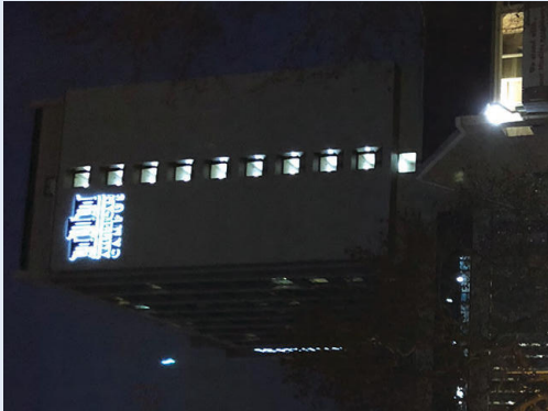
SOUTH ELEVATION - High Level Sign, Illuminated NOTE: The Sign located on the North Elevation is the same design, also illuminated.