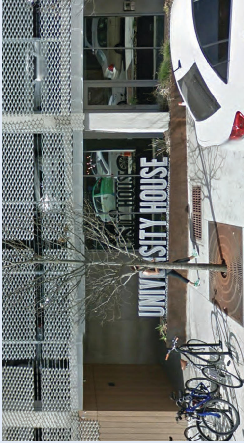
EAST ELEVATION - Low Level Sign, Illuminated Identity at Leasing Center entrance.