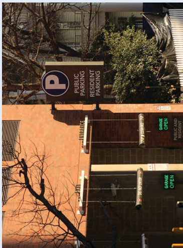
WEST ELEVATION - Low Level Sign, Non-Illuminated