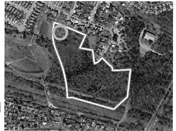
2015 Aerial View

Fully Developed Floodplain: No FEMA Floodplain: No Austin Watershed Regulation Areas: SUBURBAN Watershed Boundaries: Onion Creek Creek Buffers: No Edwards Aquifer Recharge Zone: No Edwards Aquifer Recharge Verification Zone: No Erosion Hazard Zone Review Buffer: No