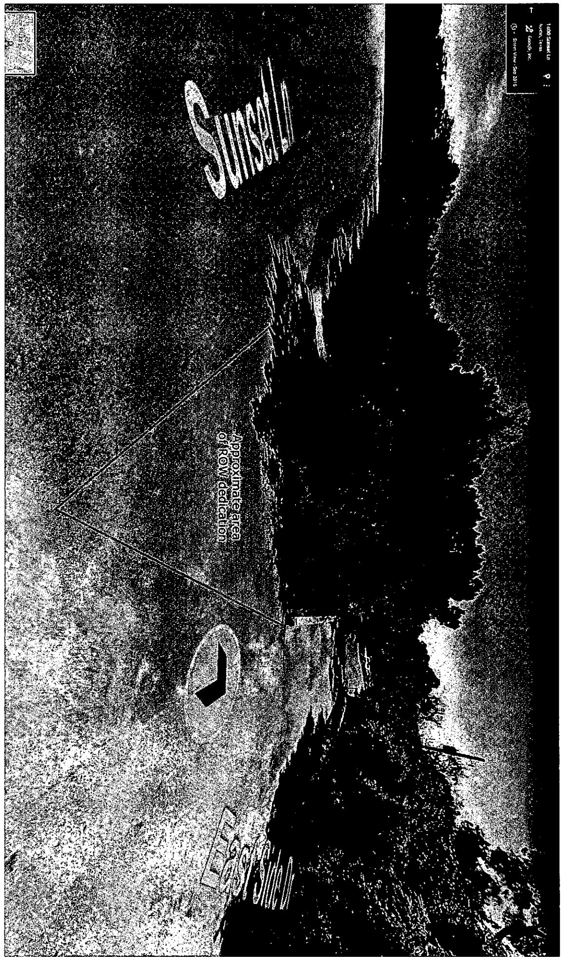
Picture of approximate area to be dedicated as ROW. Showing that area is currently used as roadway. No proposed changes to this area.