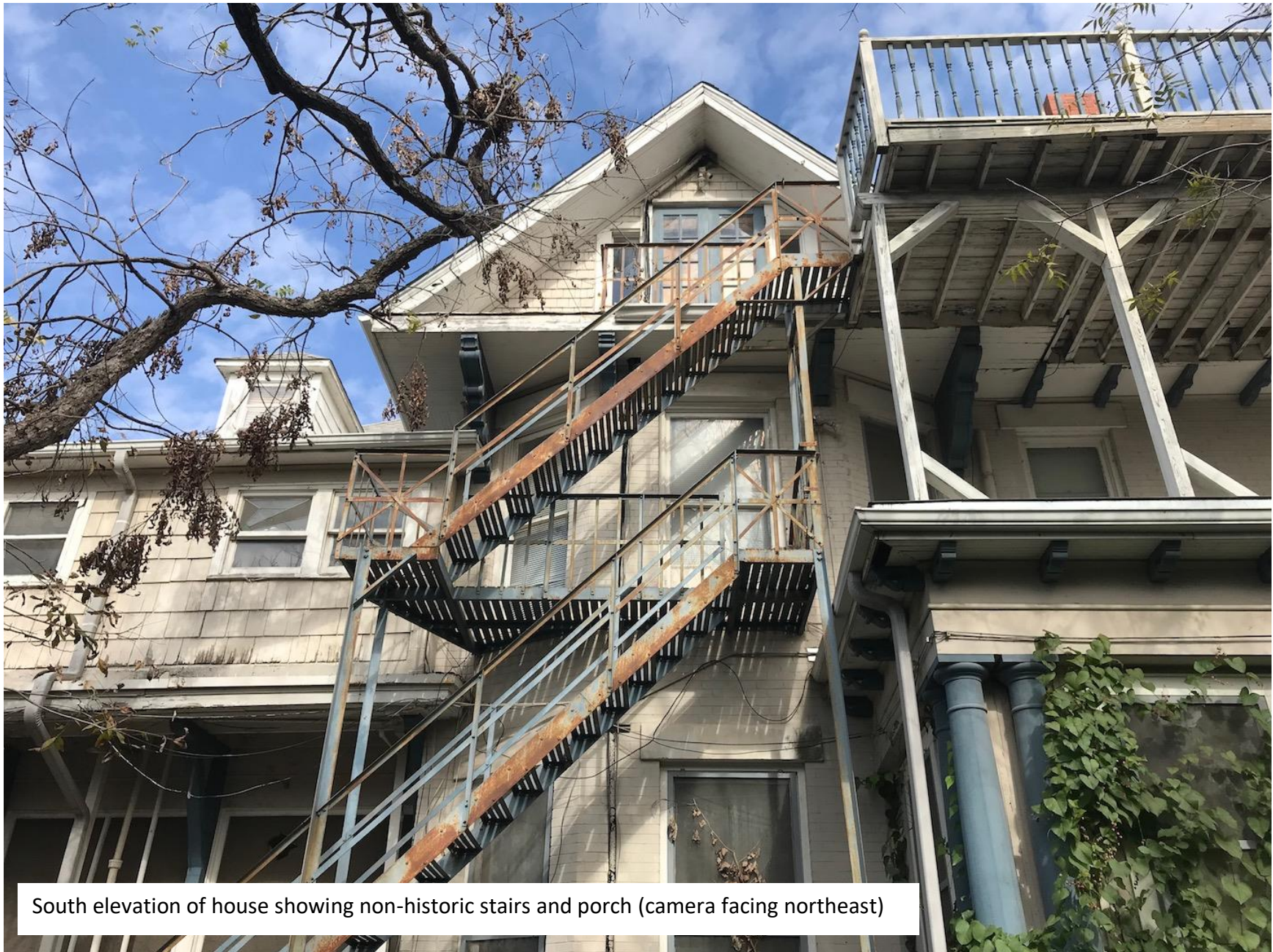
South elevation of house showing non-historic stairs and porch (camera facing northeast)