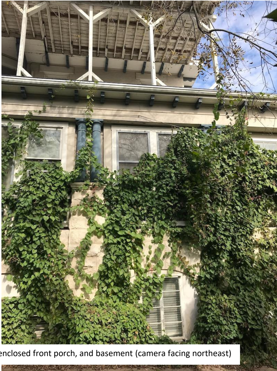
South elevation showing enclosed front porch, and basement (camera facing northeast)