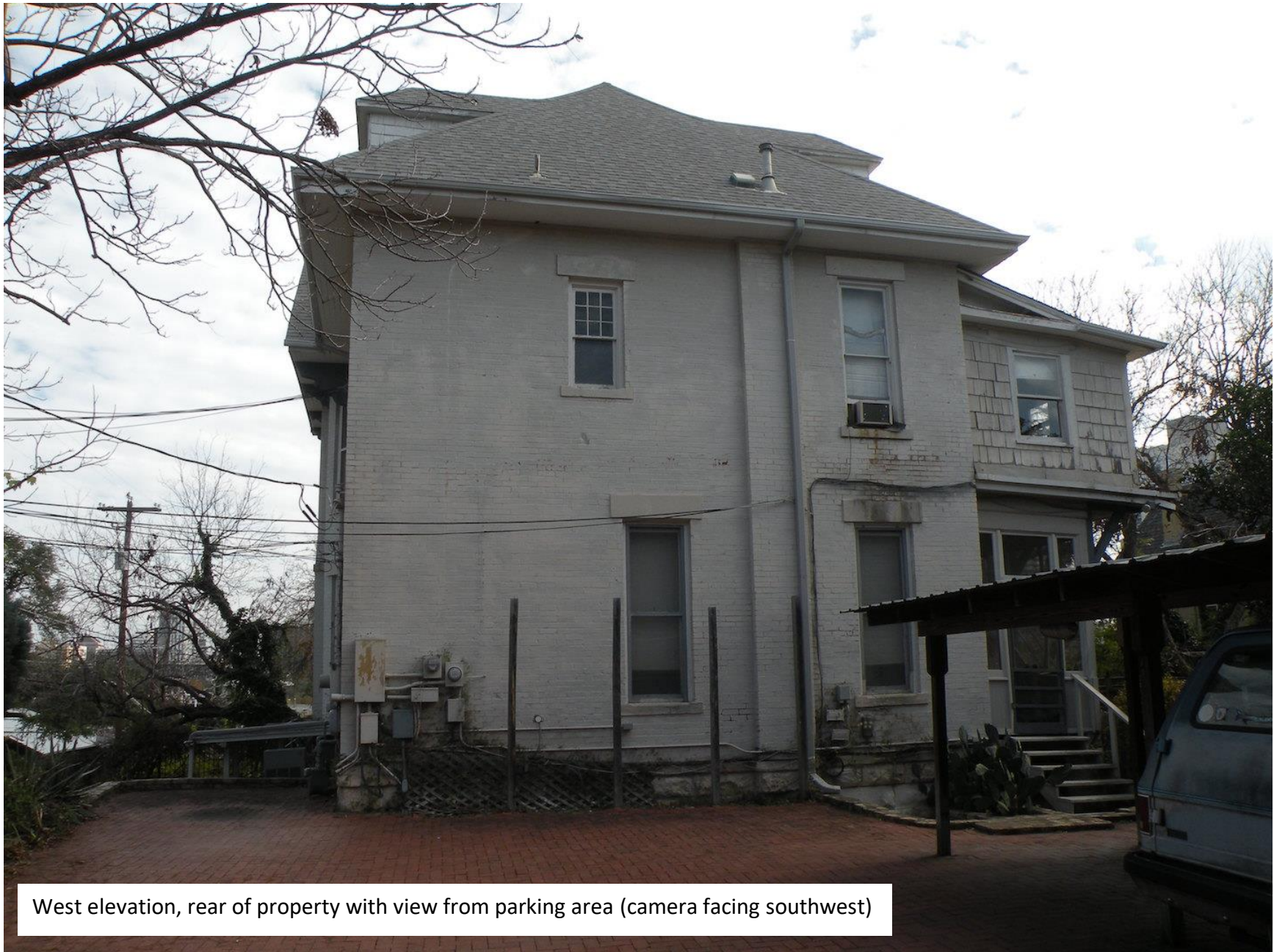
West elevation, rear of property with view from parking area (camera facing southwest)