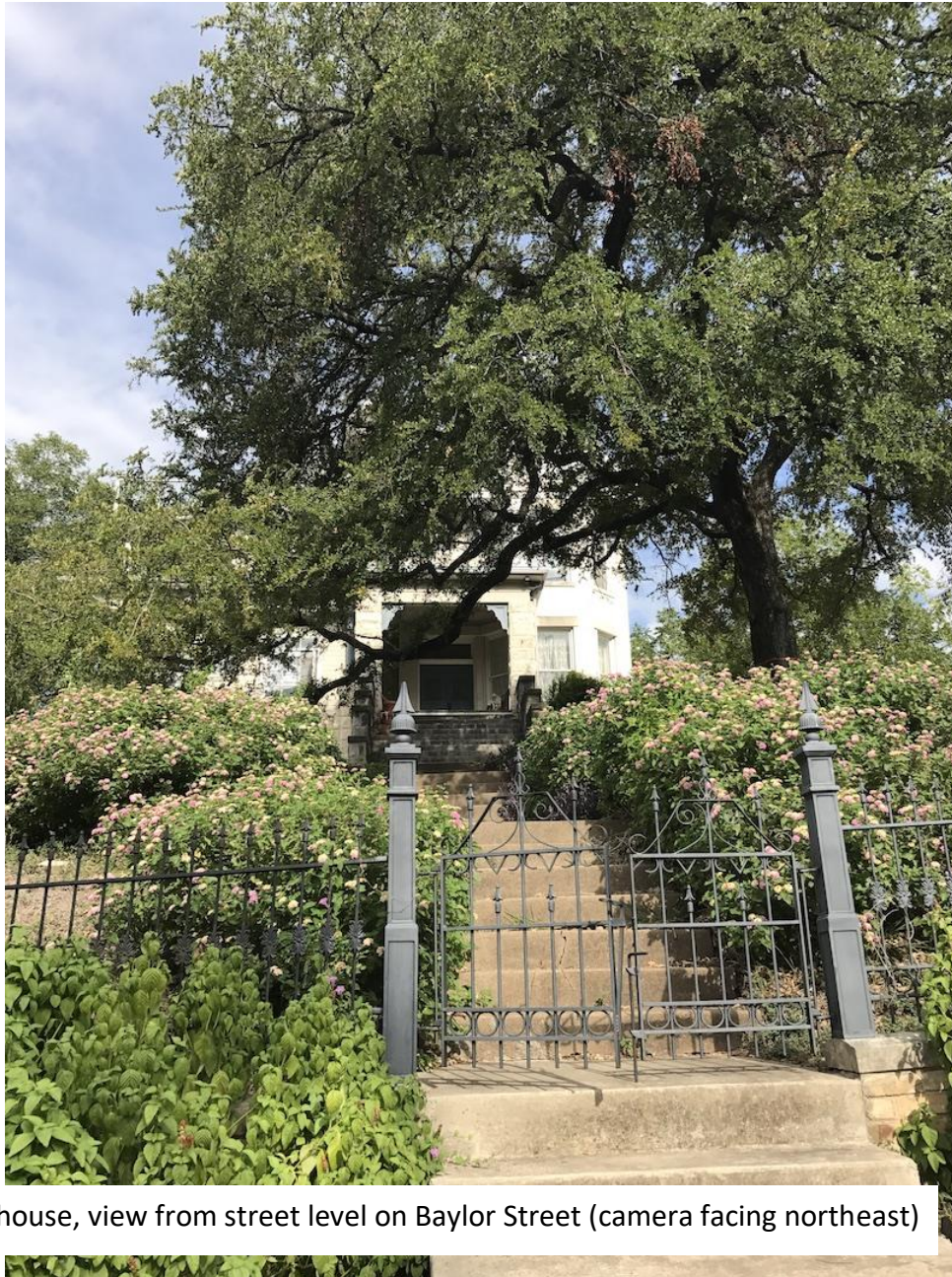
East elevation at front of house, view from street level on Baylor Street (camera facing northeast)