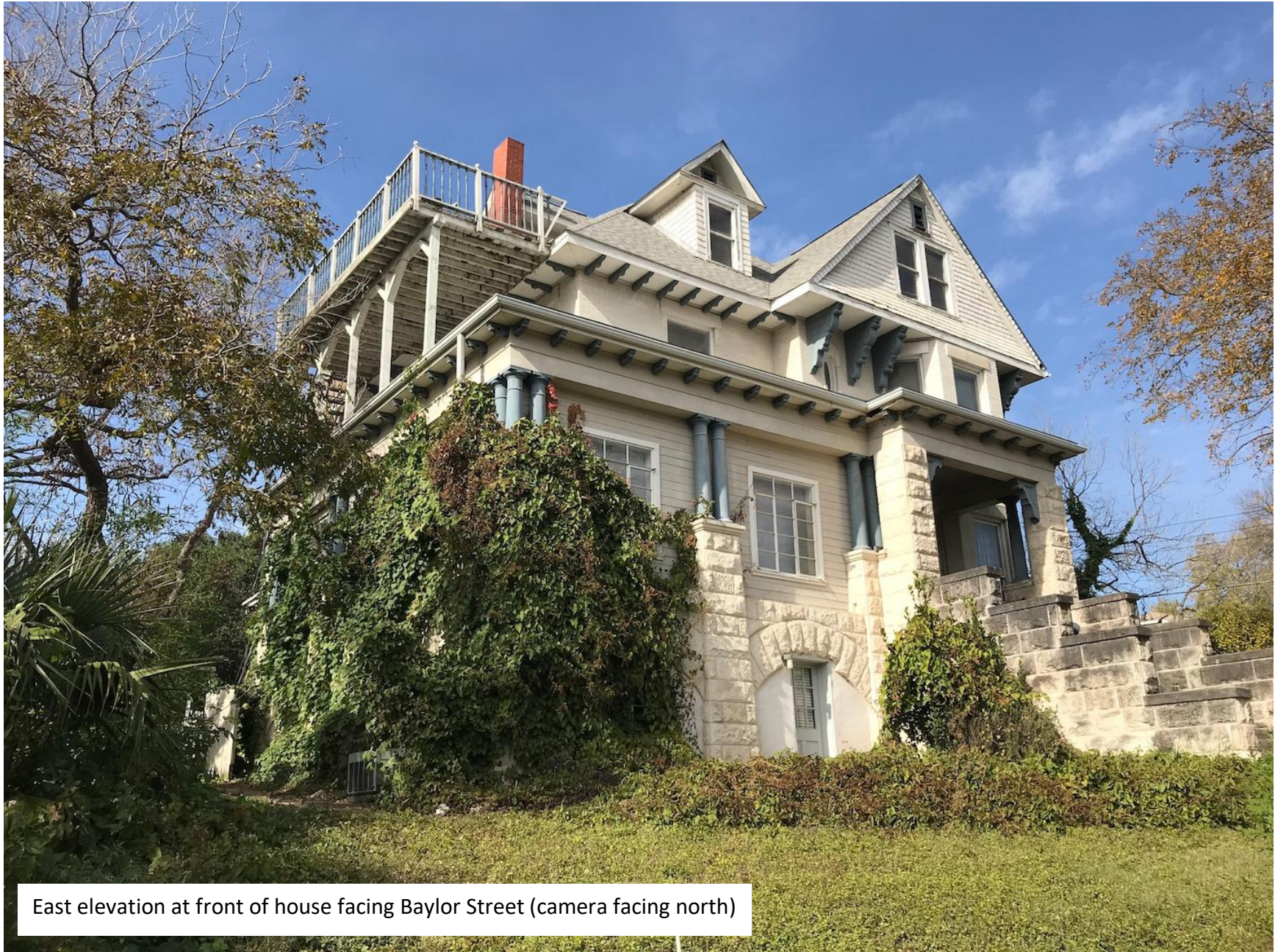
East elevation at front of house facing Baylor Street (camera facing north)