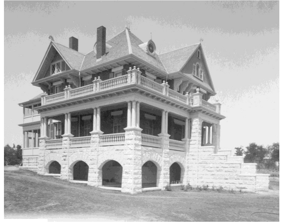
Southeast corner of house: Existing condition LEFT, undated historic photo, RIGHT