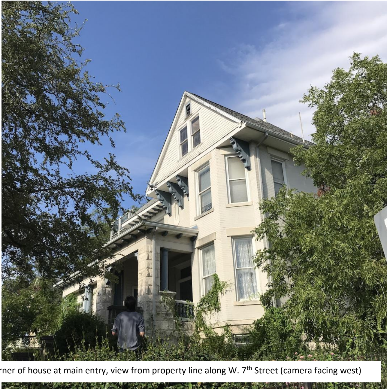
Northeast corner of house at main entry, view from property line along W. 7 th Street (camera facing west)