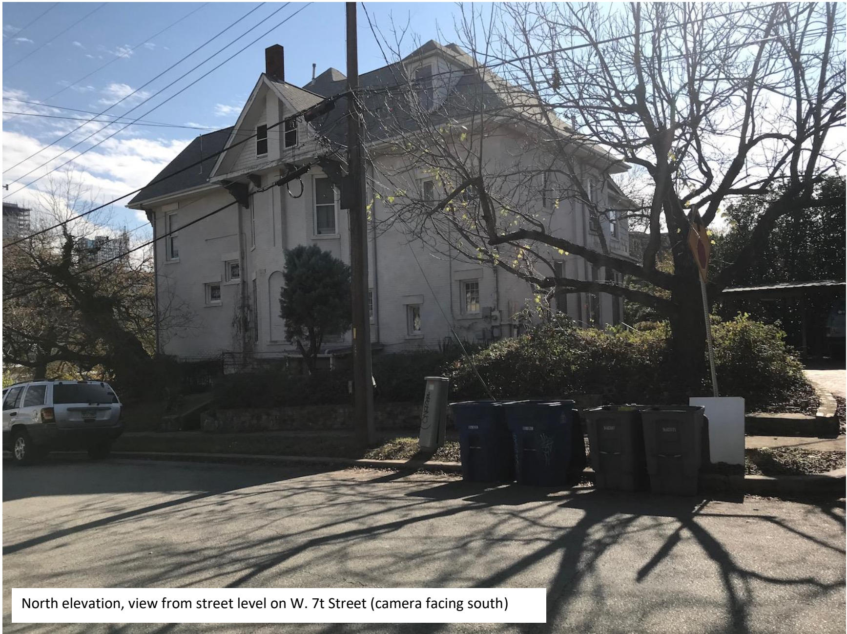
North elevation, view from street level on W. 7t Street (camera facing south)