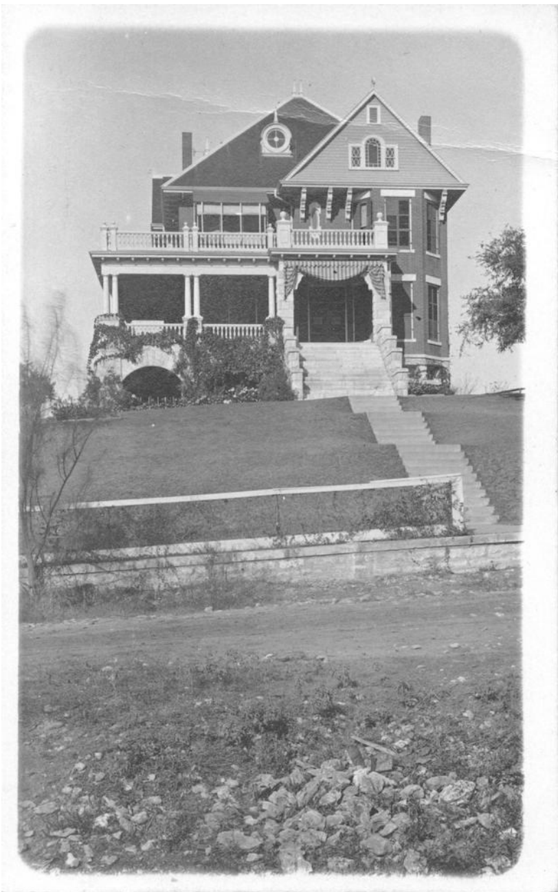
Front of House (East Elevation) undated Historic photo taken from street level on Baylor Street