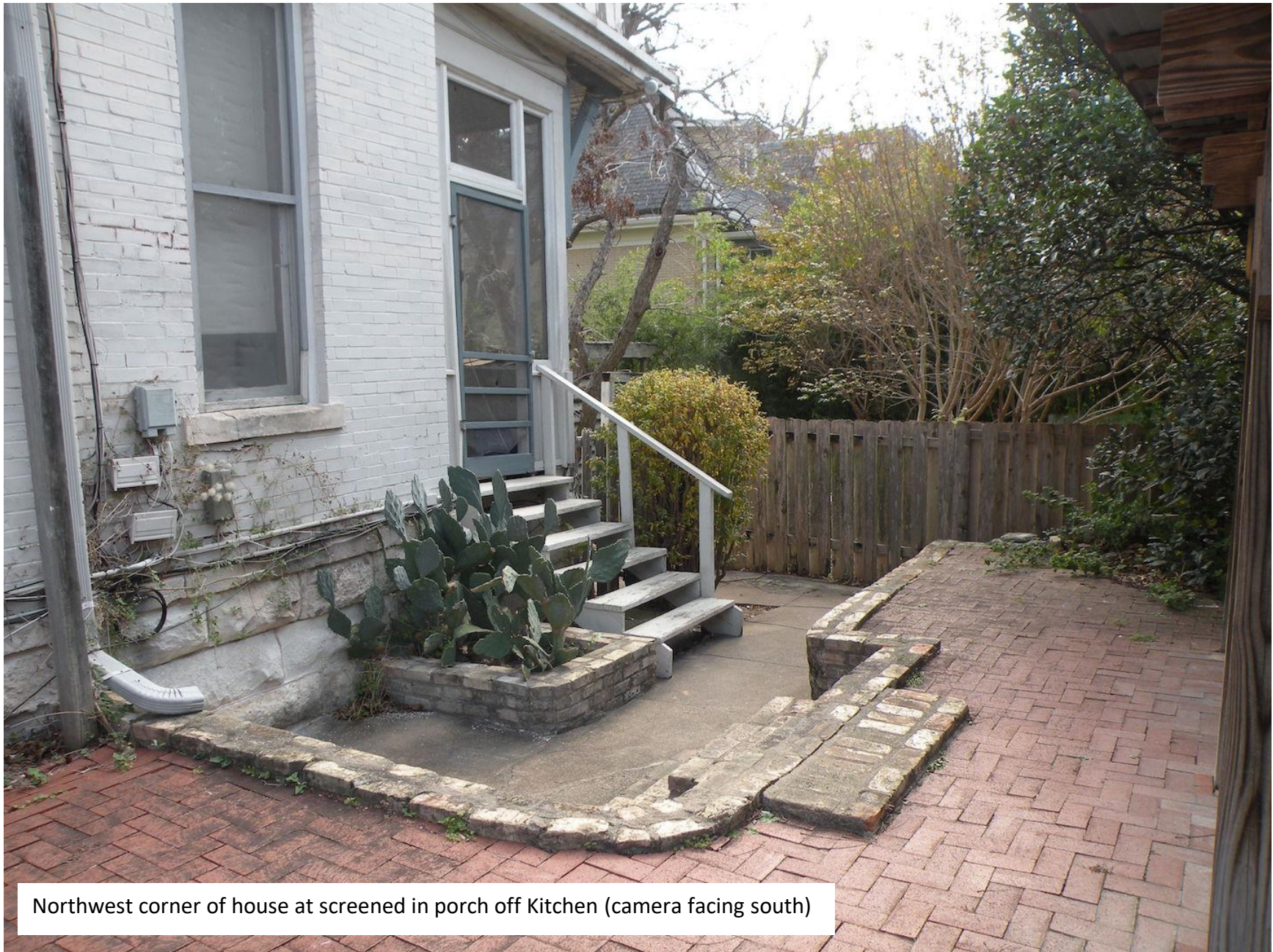
Northwest corner of house at screened in porch off Kitchen (camera facing south)