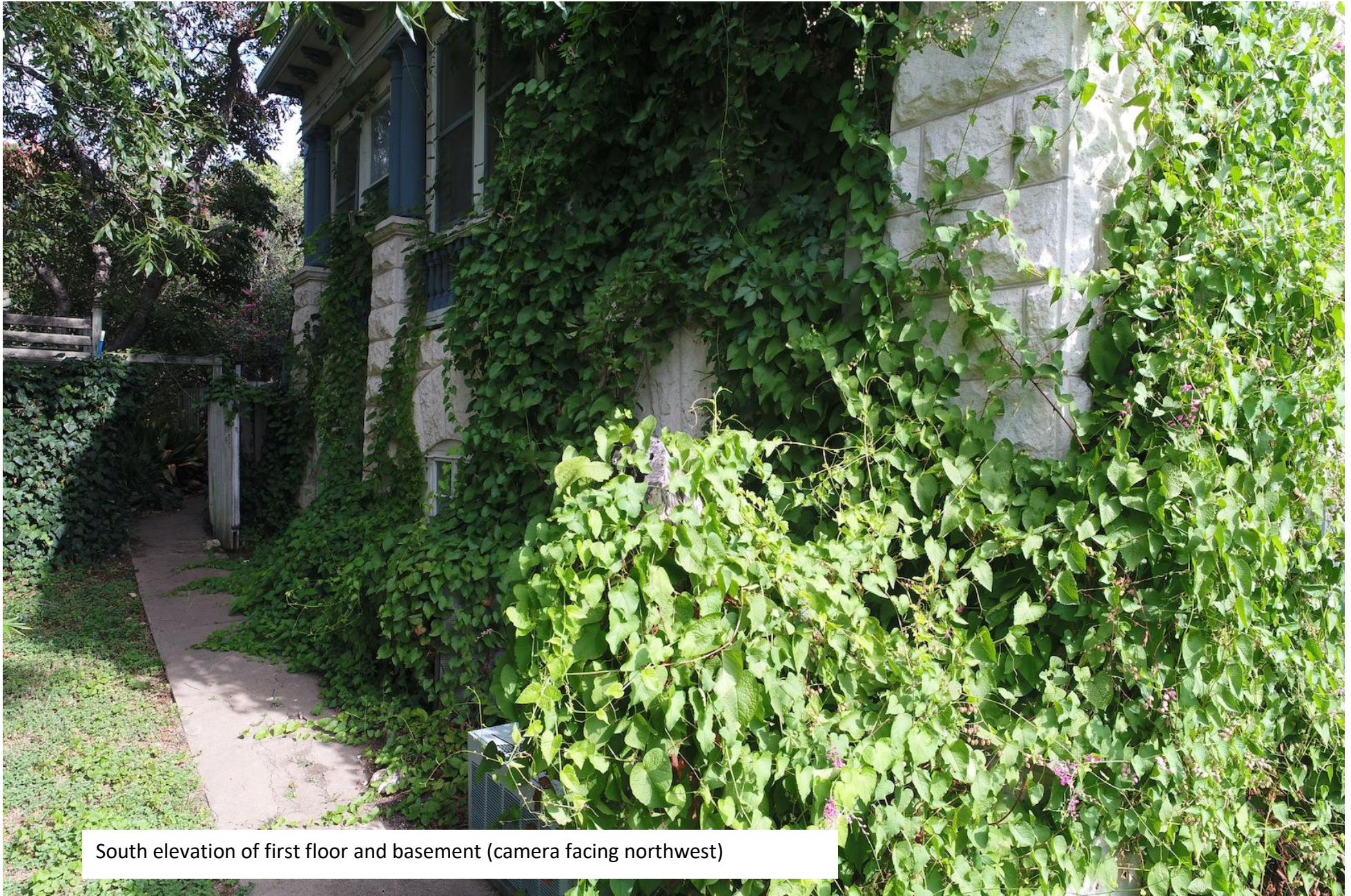
South elevation of first floor and basement (camera facing northwest)