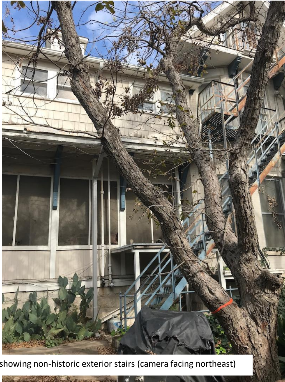
South elevation of house showing non-historic exterior stairs (camera facing northeast)