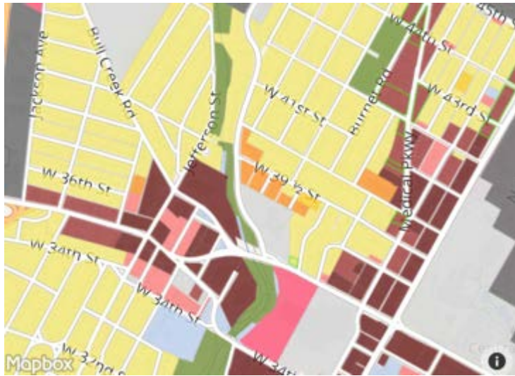
The reddish brown area is the biggest impact area:

MS-ZONING – MS 3A & MS3B are intended for high-intensity urban main street environments, located in Regional Centers or along well-connected corridors.