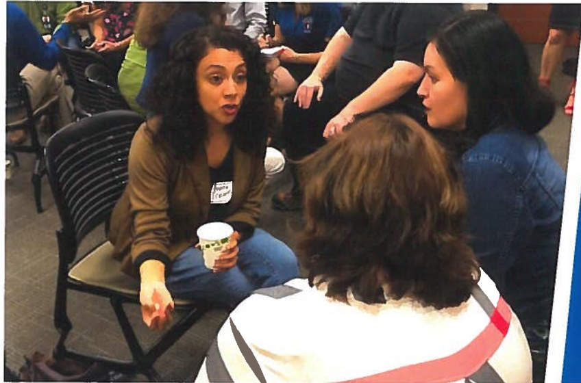
Community members and city staff working together to address equity in the city's new strategic plan.