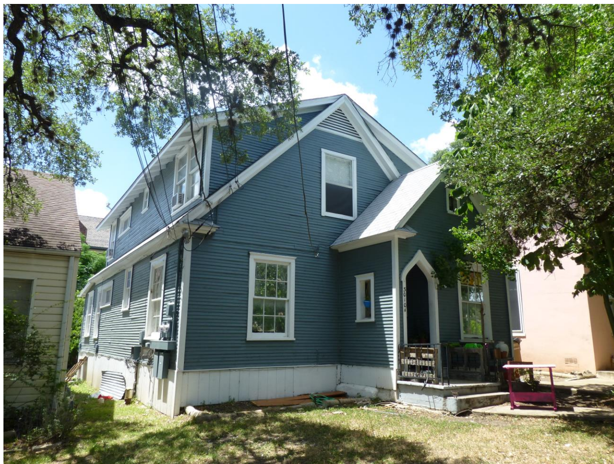
Primary (east) façade and south elevation of 3010 University Avenue.