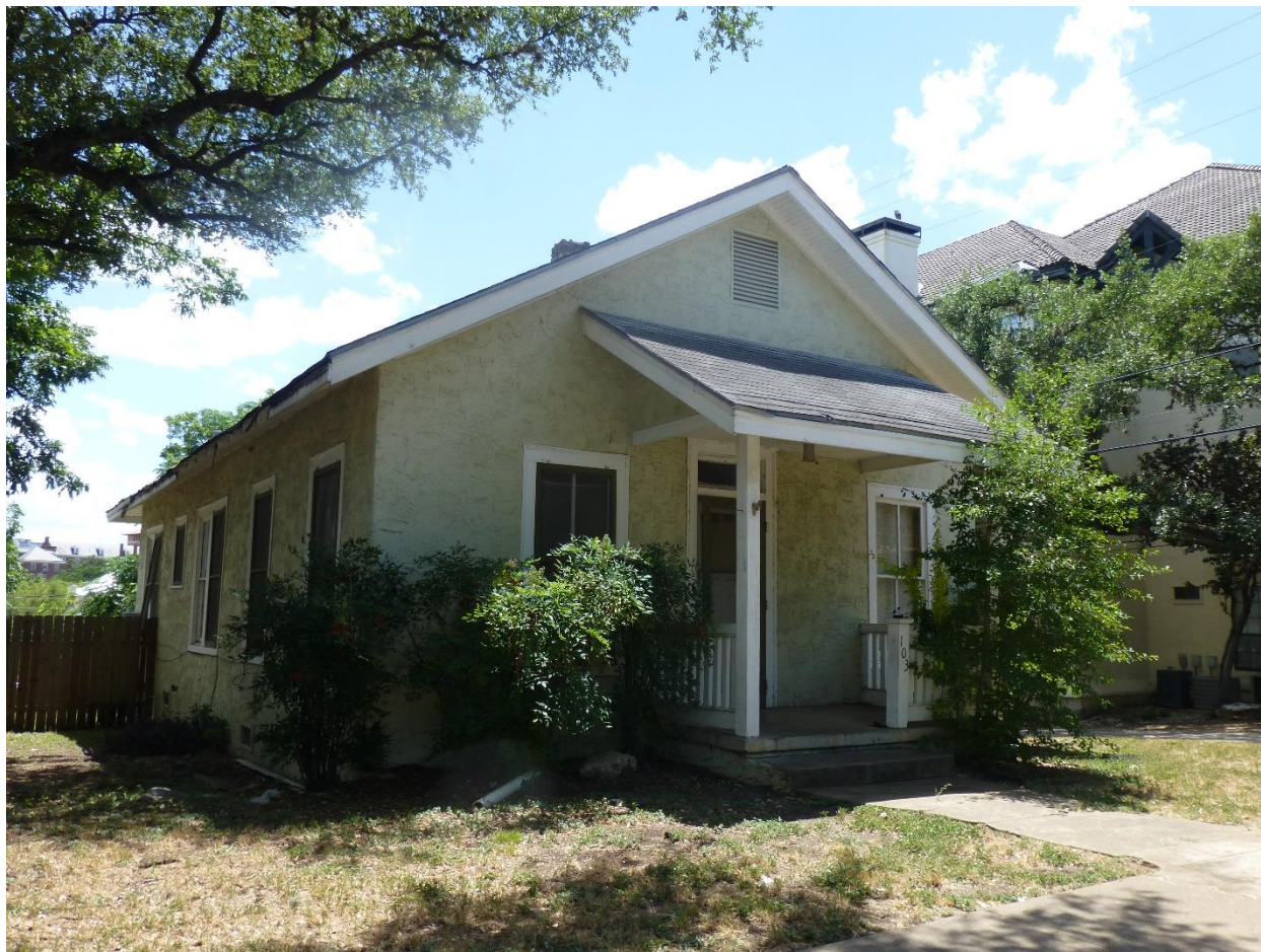
Primary (north) façade and east elevation of 103 W. 31 st Street.