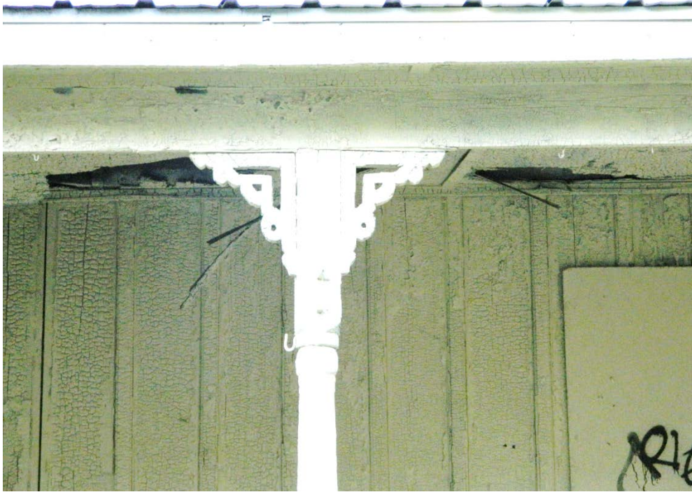
2018 photograph showing porch bracket detail and damage to porch ceiling.

City Directory Research, Austin History Center By City Historic Preservation Office July, 2010