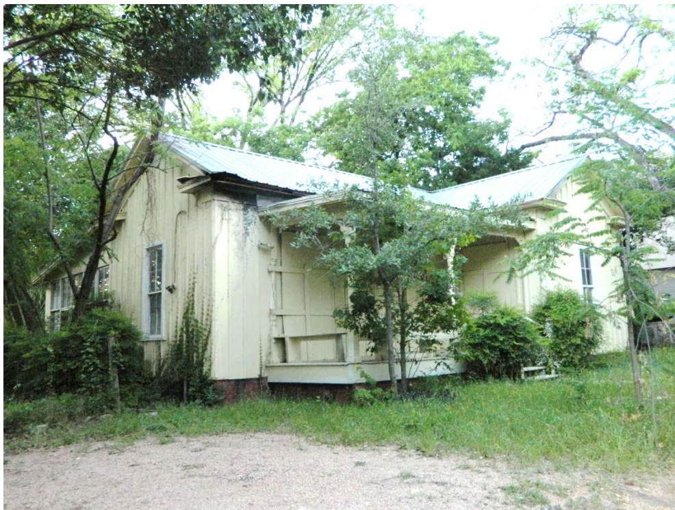
2018 photograph shows fire damage to corner of the house and the porch ceiling.