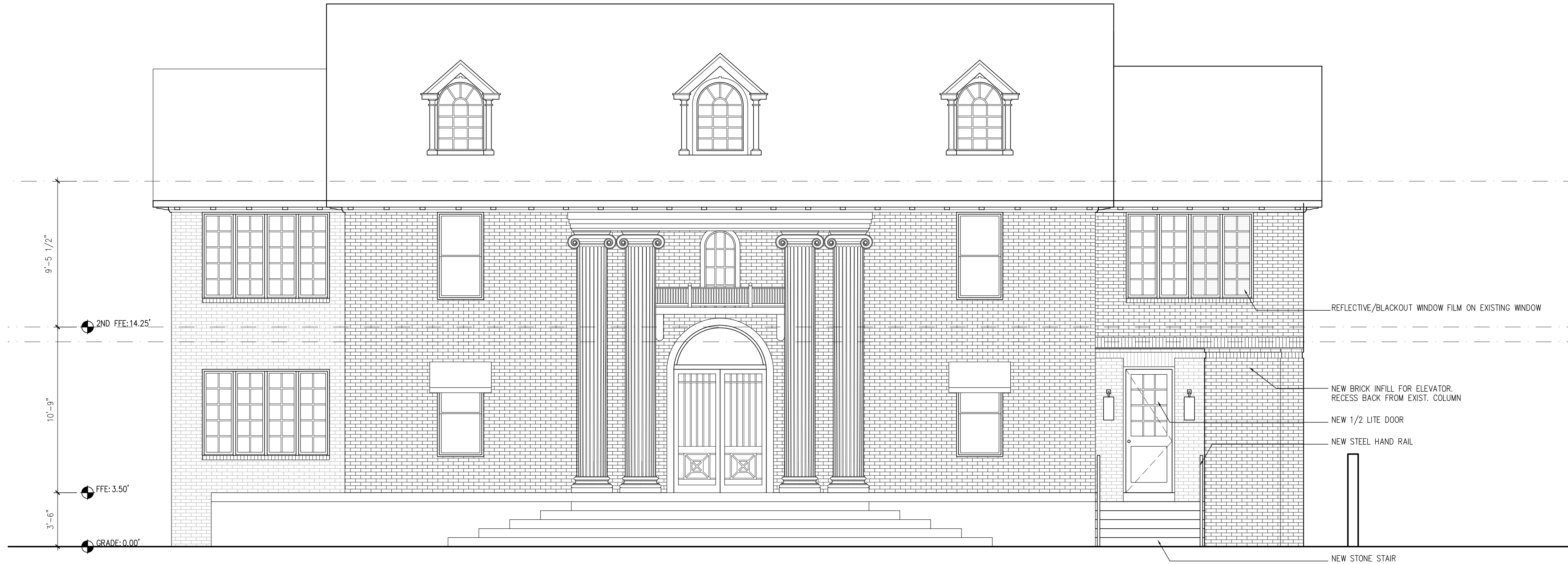
1 NEW FRONT ELEVATION SCALE: 1/4" = 1'-0" SCALE: 1/8" = 1'-0" WHEN PRINTED AT HALF SIZE