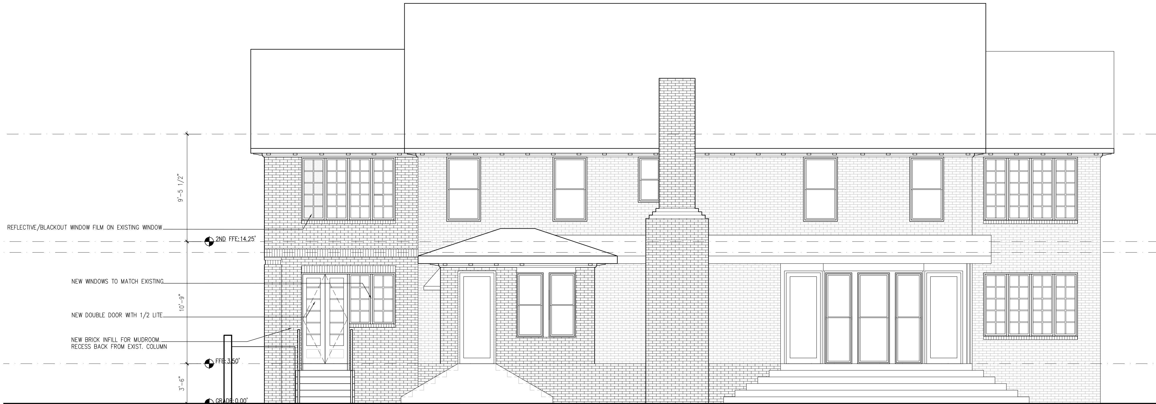
1 NEW BACK ELEVATION SCALE: 1/4" = 1'-0" SCALE: 1/8" = 1'-0" WHEN PRINTED AT HALF SIZE