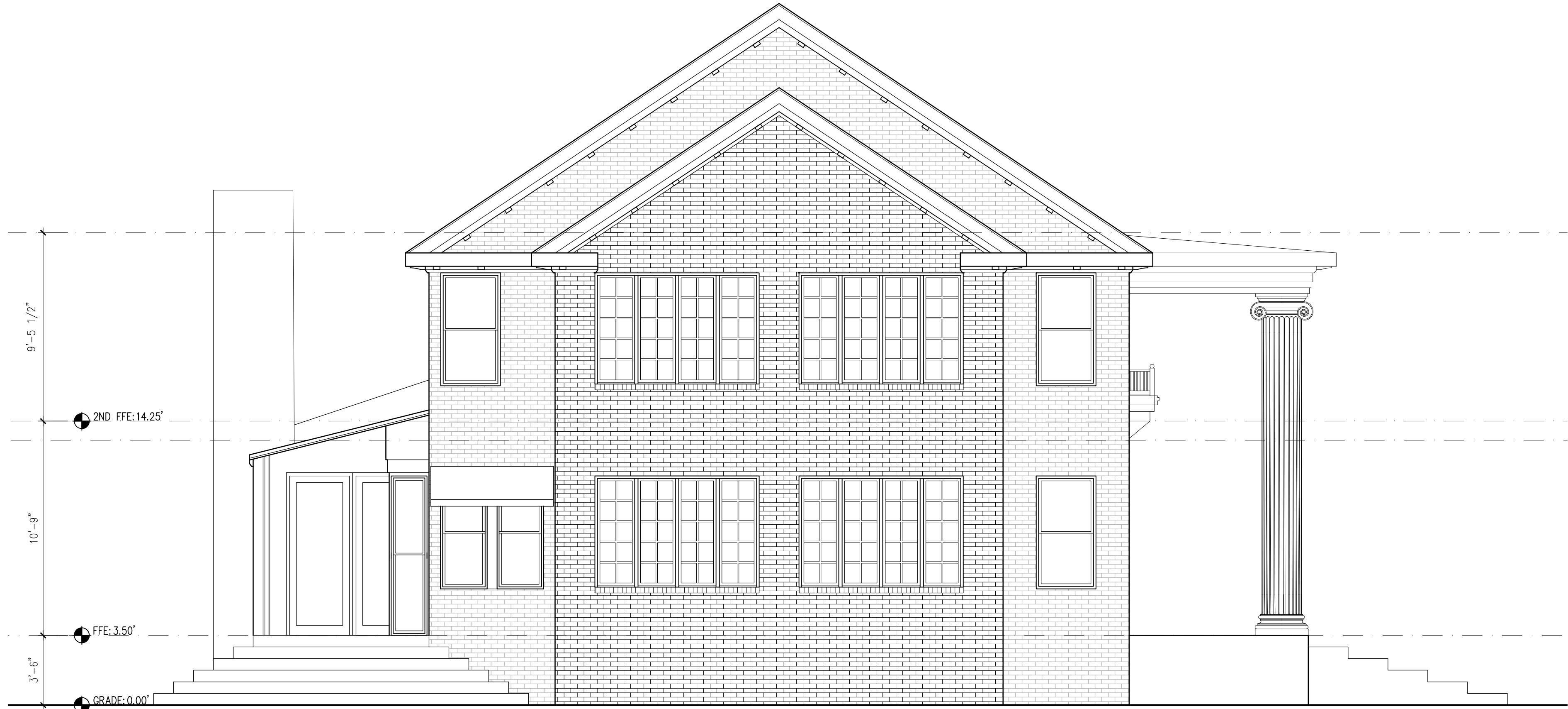
2 SIDE ELEVATION SCALE: 1/4" = 1'-0" SCALE: 1/8" = 1'-0" WHEN PRINTED AT HALF SIZE