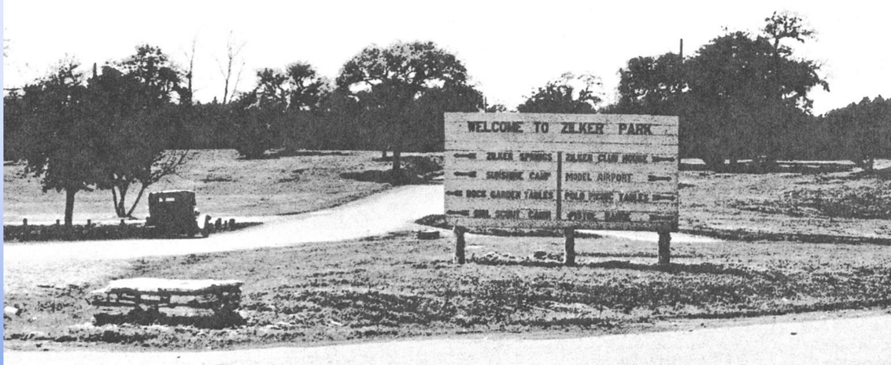
Zilker Park Entrance March 25, 1948