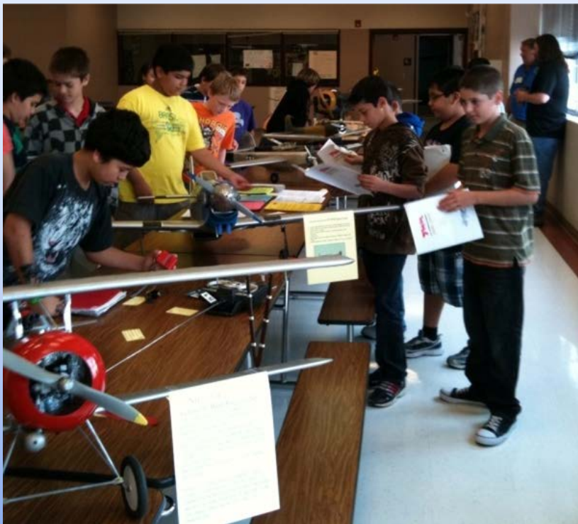
Small Middle School Robotics Class