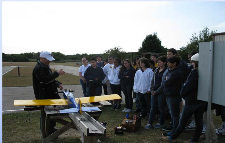
Paredes Middle School Classes