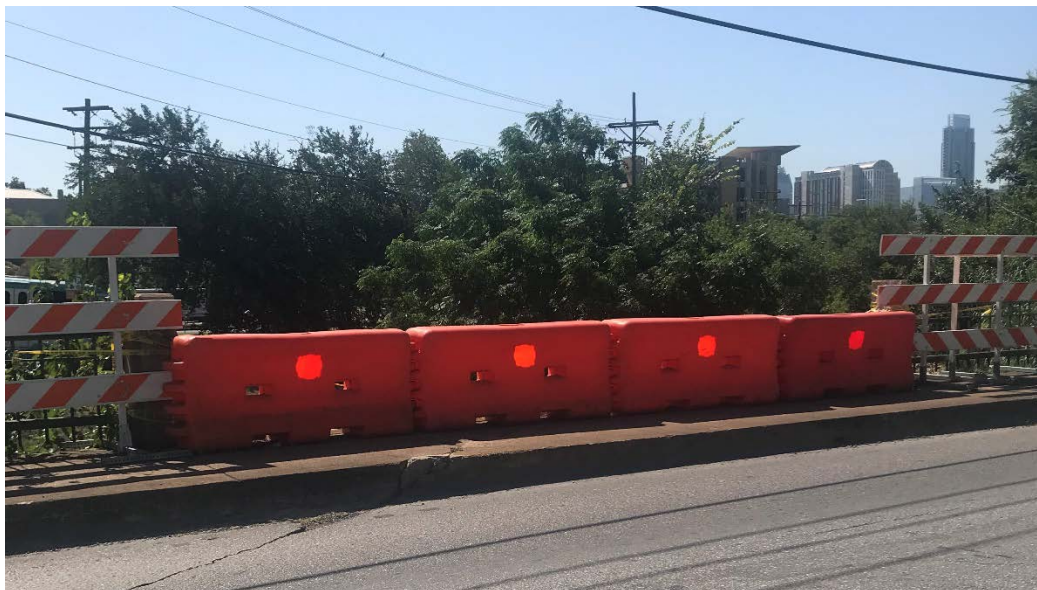
Figure 2. Temporary Barriers