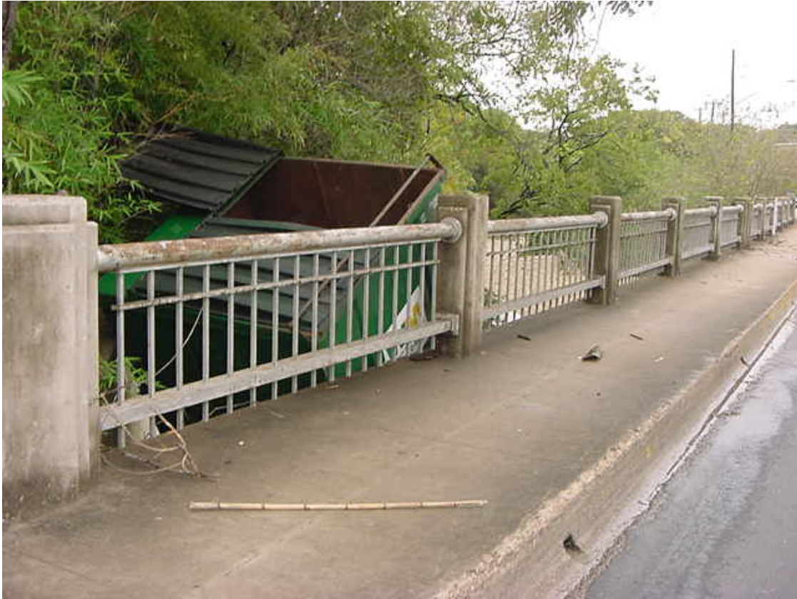
Figure 3. Silver Painted Rail with Gray Concrete (Dated November 16, 2001)