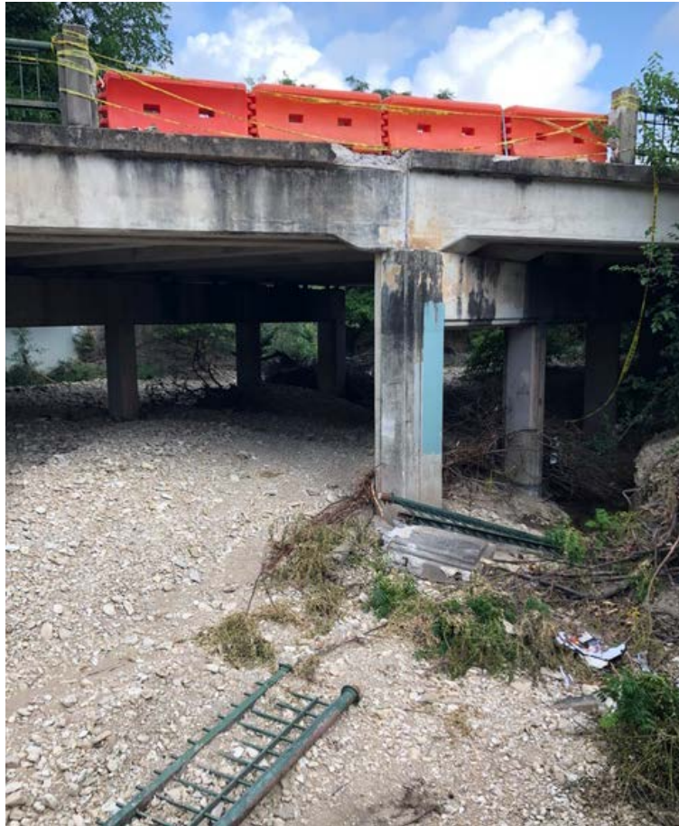
Figure 1. Damaged Rail