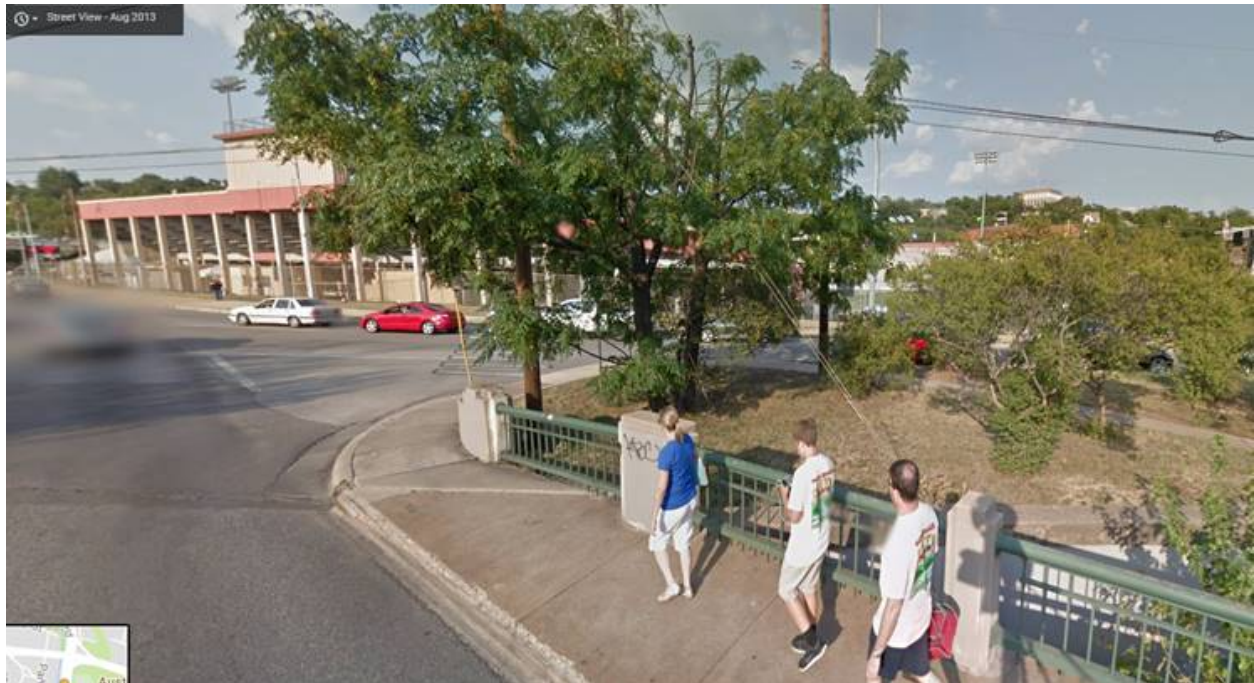
Figure 4. Google Street View (Dated August 2013)