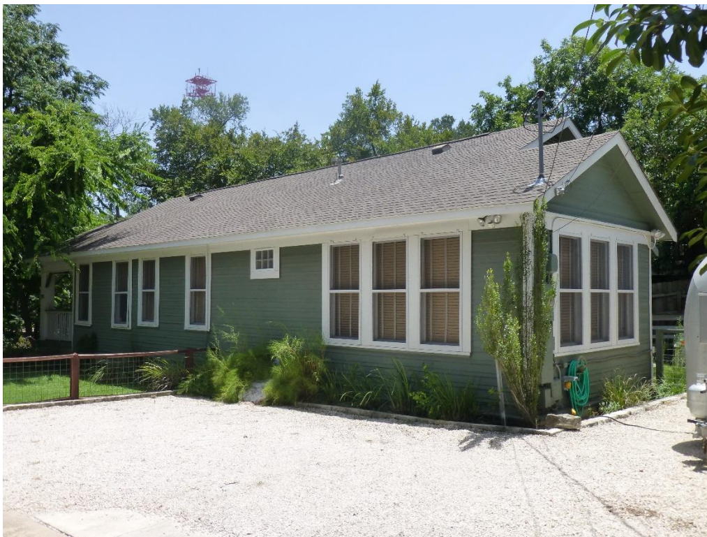
North and west elevations.