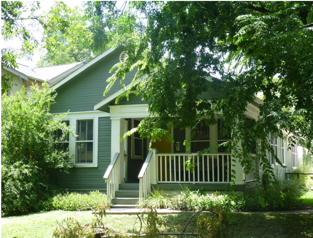
East (primary) façade of 1010 Charlotte Street/1701 W. 11 th Street.