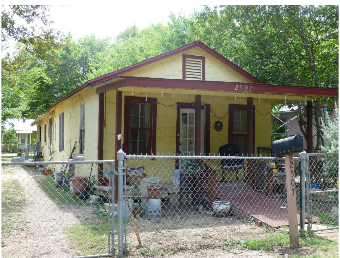
Primary (north) façade of 2507 E. 4th Street.