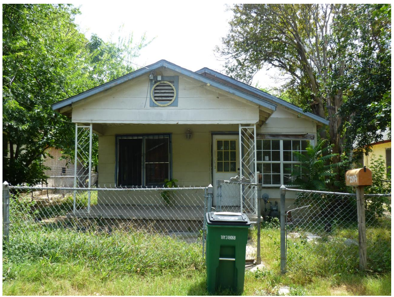
Primary (north) façade of 2509 E. 4th Street.