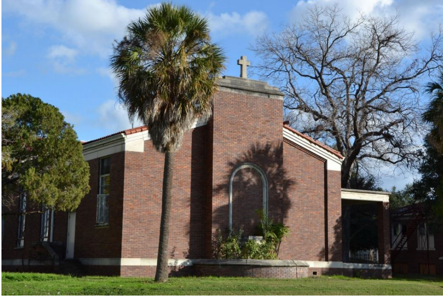
Photo, 2017, Built in 1947-Contributing building on the National Register