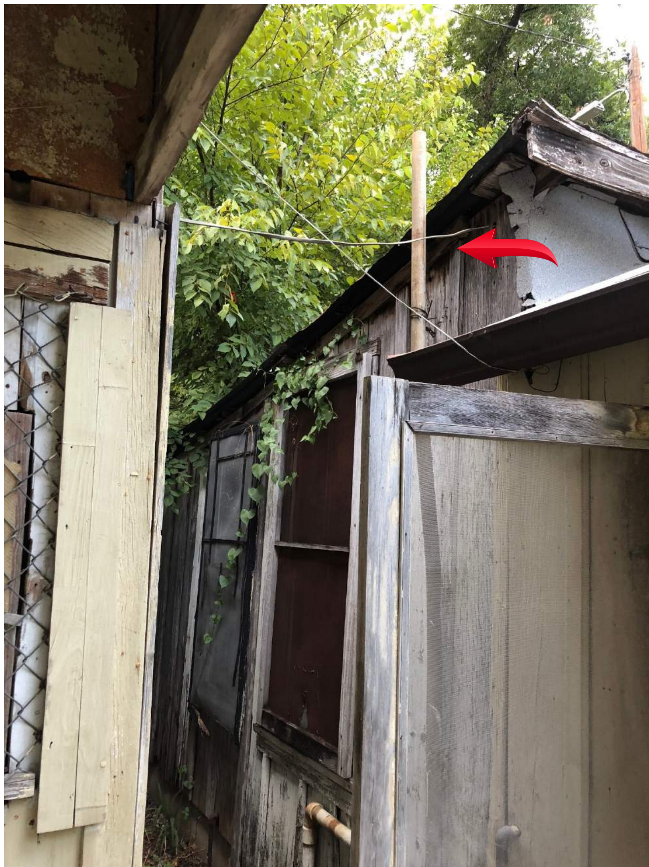
OLD SHED/ ROTTEN ROOF