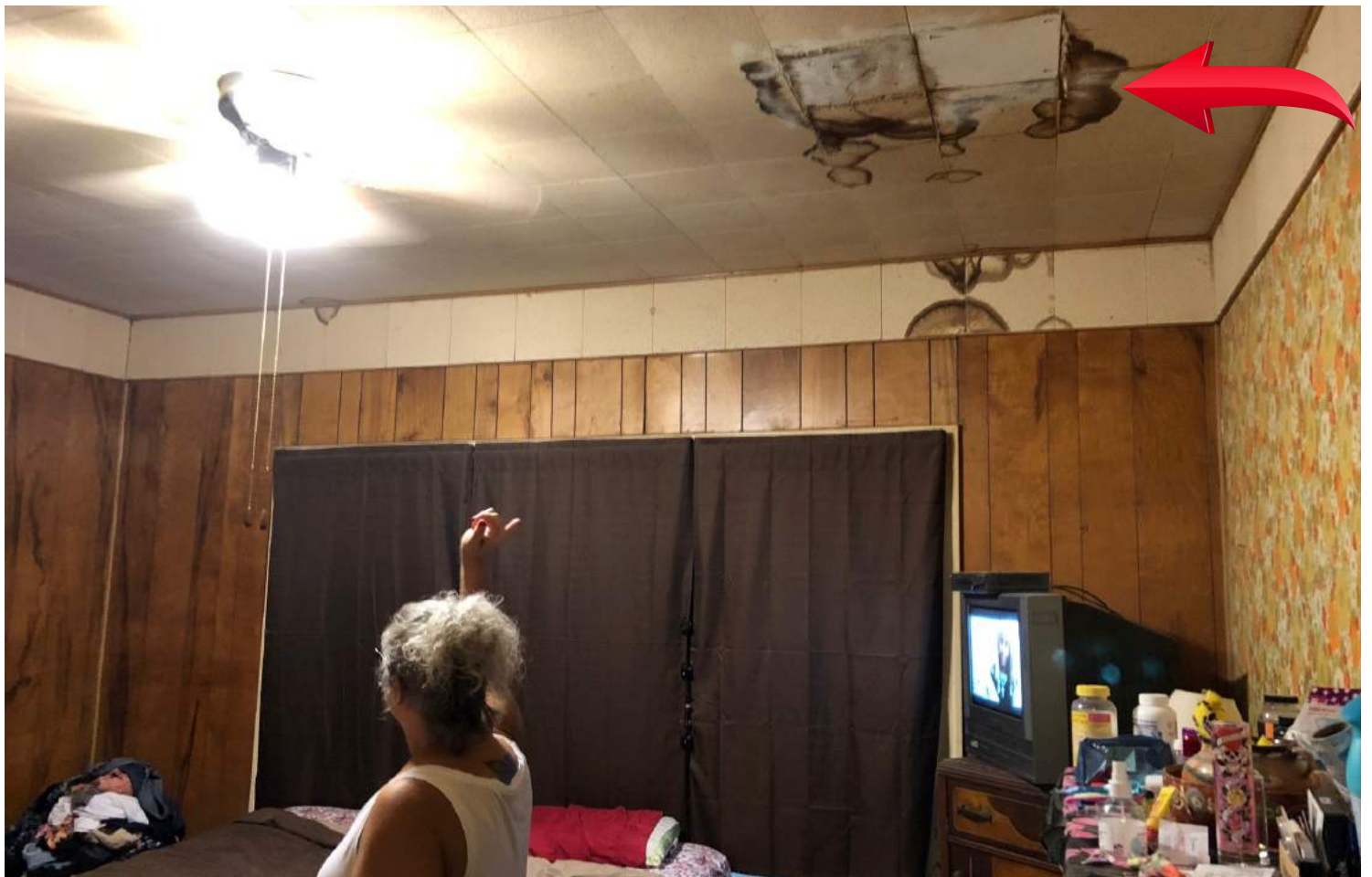
ROTTEN ROOF/ LEAKS