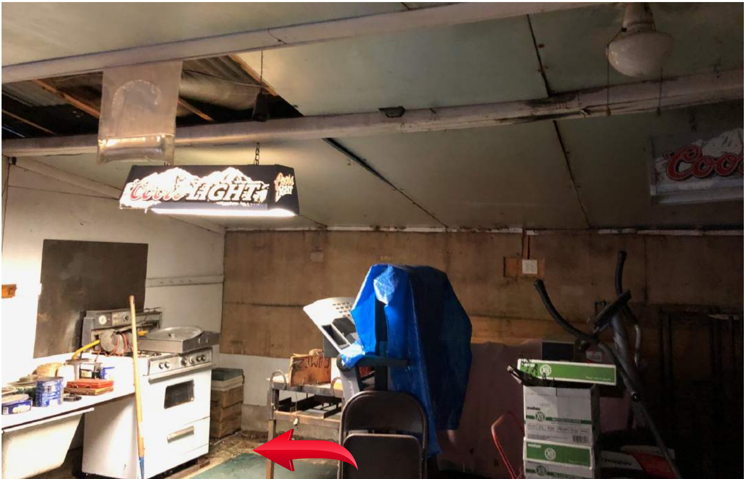
OLD ROOFING W/ LEAKS