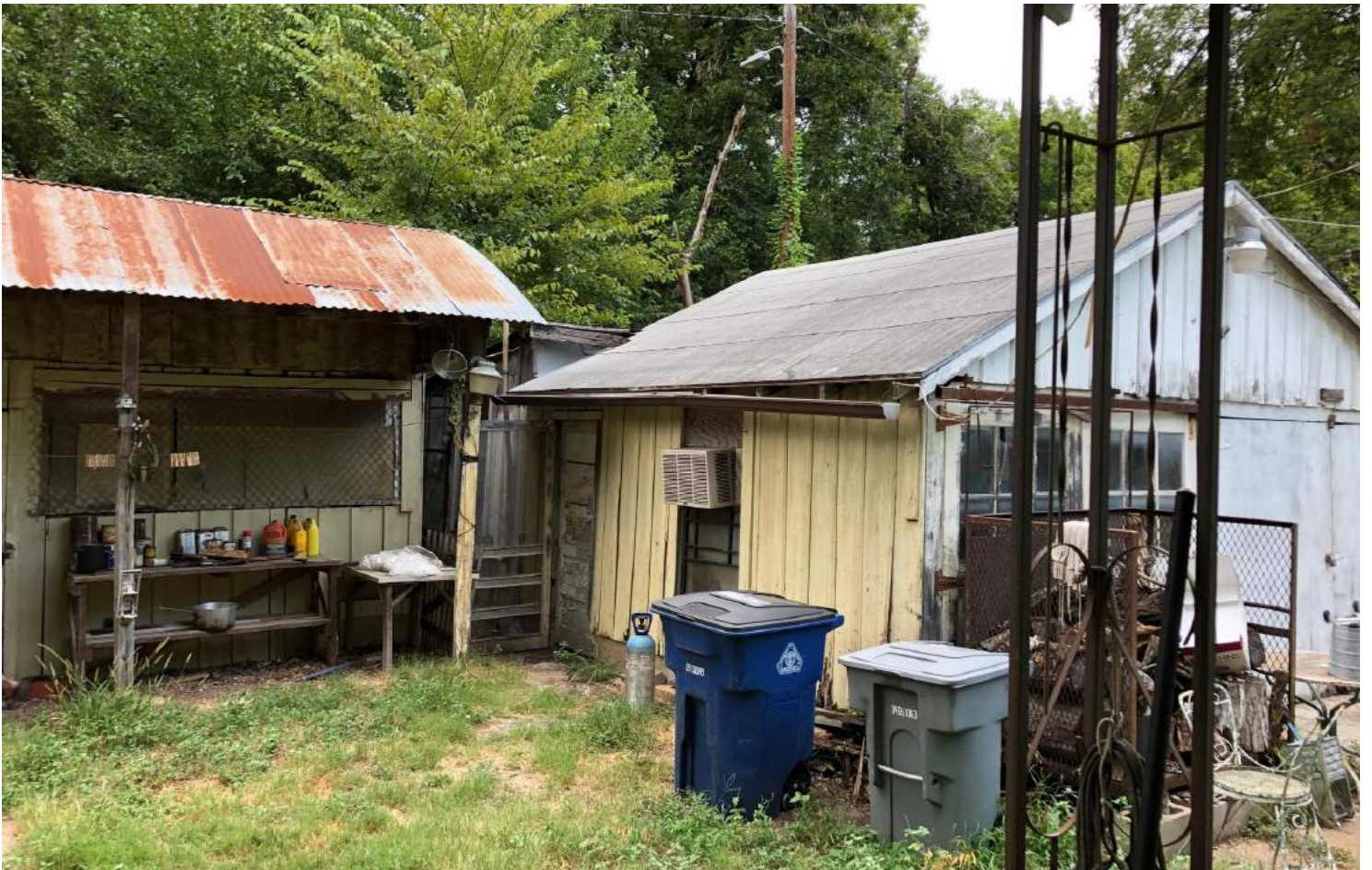
OLD SHED / NOT STABLE