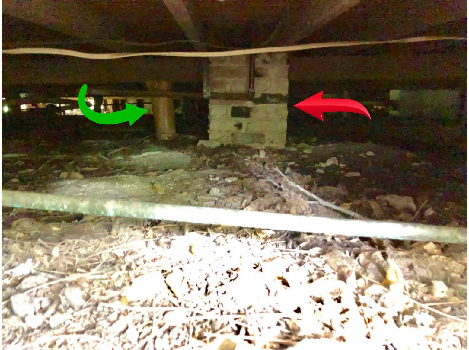
HOUSE IS ON BLOCKS AND TREE POST