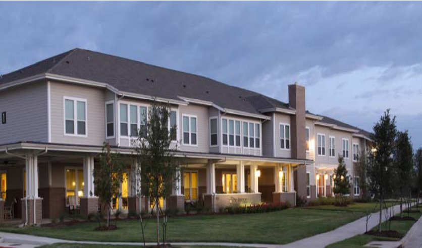
The Terrace at MidTowne, 991 Abigail Way, Midlothian, TX

DMA Development Company has perfected its senior independent living design in recent years. The typical DMA senior community consists of one two- or three-story elevator structure surrounded by single story cottages. The elevator structure is attractive to seniors who want the security of proximity to the onsite staff and amenities, while the single story cottages, which often have integrated carports, are attractive to independent residents who are perhaps downsizing from single family homes.