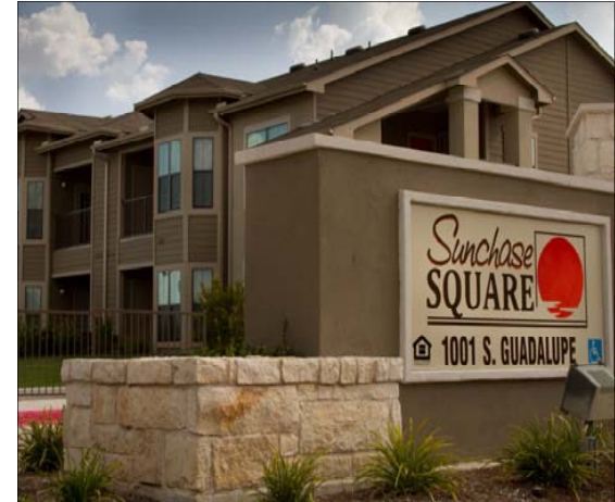
Sunchase Square, 1001 S. Guadalupe Street, Lockhart, TX