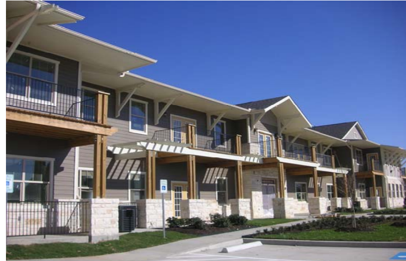
Cambridge Crossing, 1900 Cambridge Street, Corsicana, TX