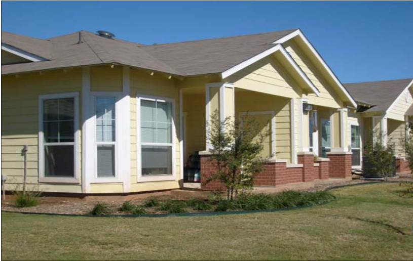
Arbors at Rose Park, 2702 S. 7th Street, Abilene, TX