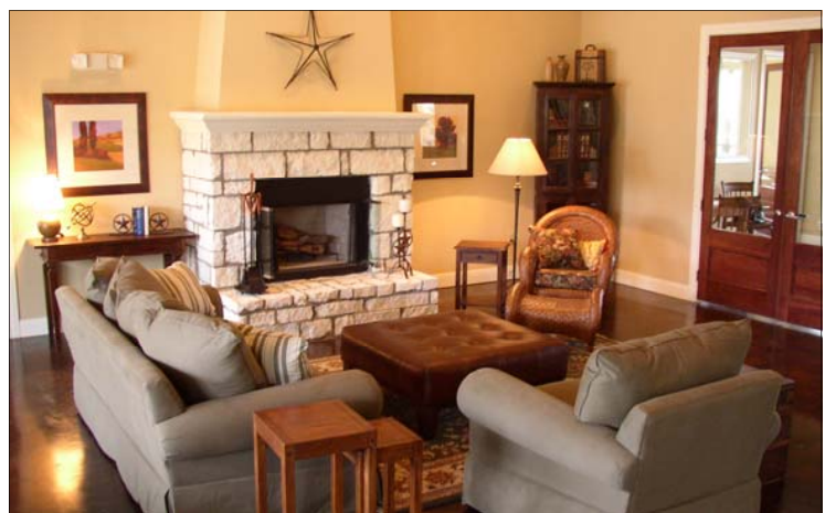
Prairie Commons, 9850 Military Parkway, Dallas, TX