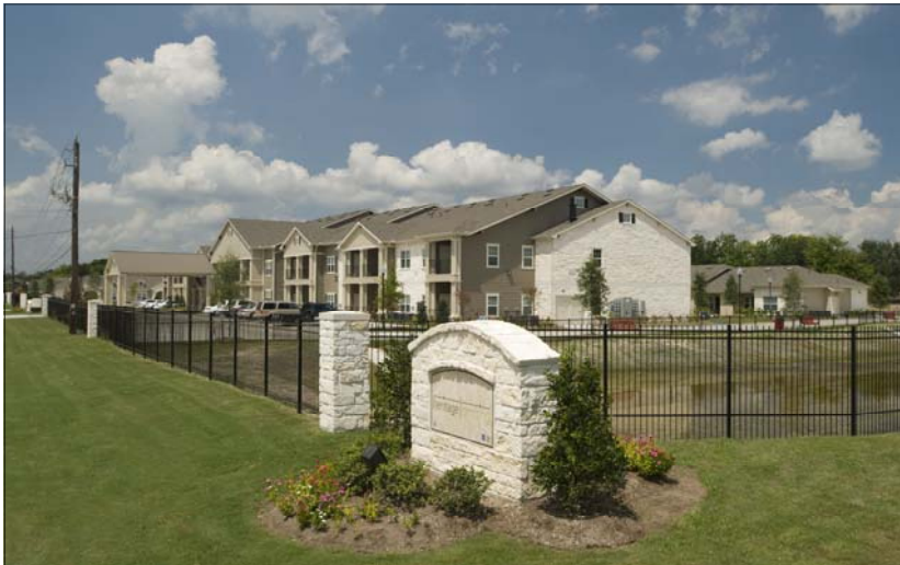
Heritage Crossing, 12402 11th Street, Santa Fe, TX