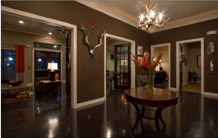
Sunchase Square, 1001 S. Guadalupe Street, Lockhart, TX