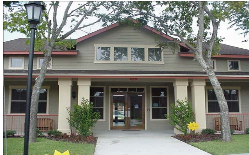
Eden Place, 1220 Jefferson Avenue, Seguin, TX