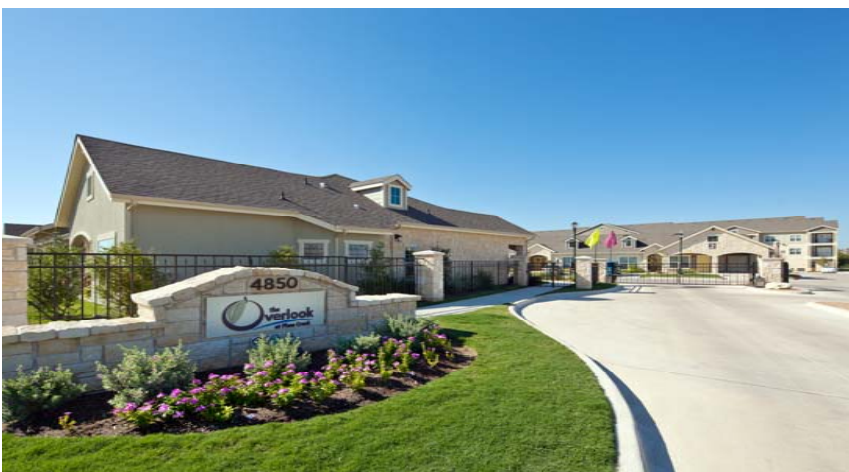
The Overlook at Plum Creek, 4850 Cromwell Drive, Kyle, T