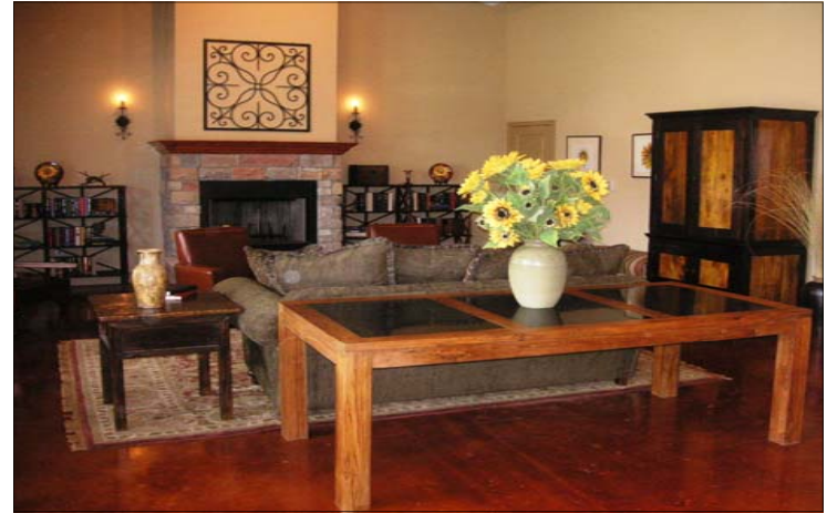
Ranch, 225 Westview Avenue, Pearsall, TX