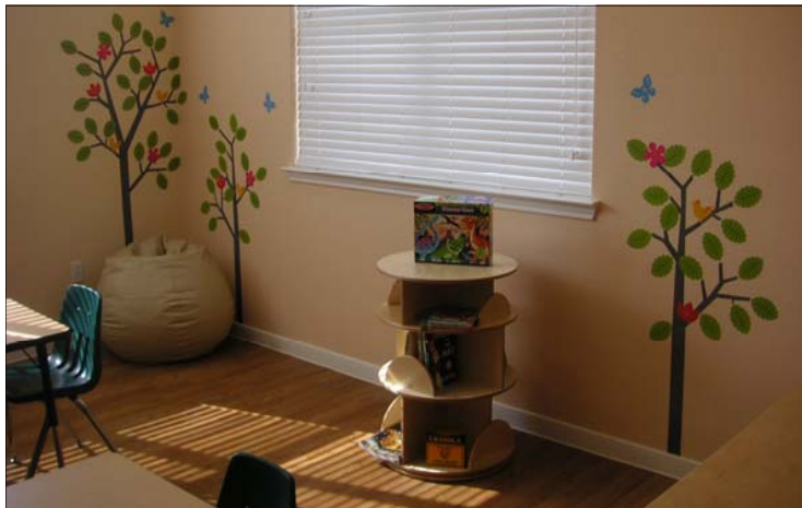
Prospect Point, 215 Premier Drive, Jasper, TX