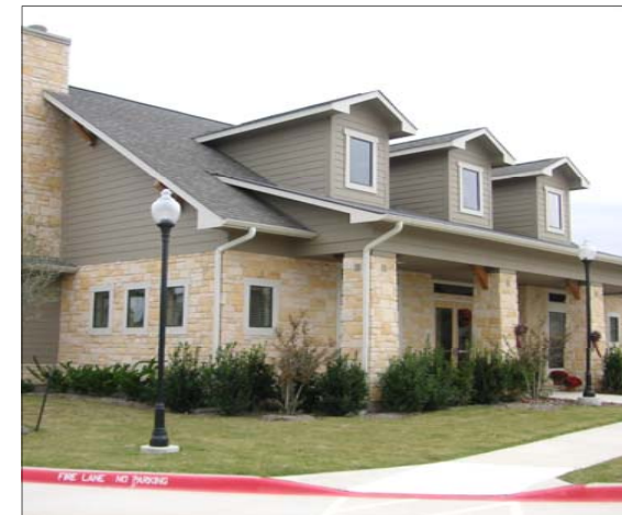
The Grove at Brushy Creek, 1101 El Dorado Street, Bowie, TX