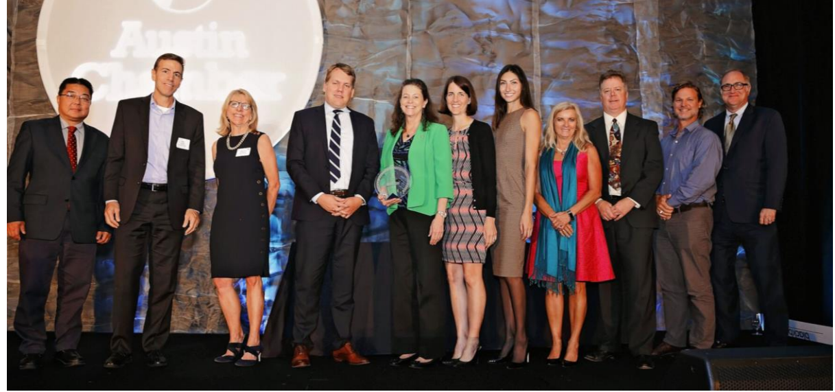
Chamber of Commerce HID Global Innovation Award