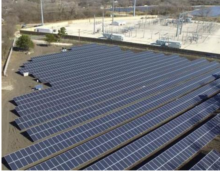
First Green-e certified community solar program