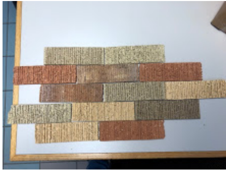
1705 Summit View Place - Match.071318.jpg 100K

This e-mail, including attachments, is intended for the person or company named and may contain confidential and/or legally privileged information. Unauthorized disclosure, copying or use of this information may be unlawful and is prohibited. If you are not the intended recipient, please delete this message and notify the sender.