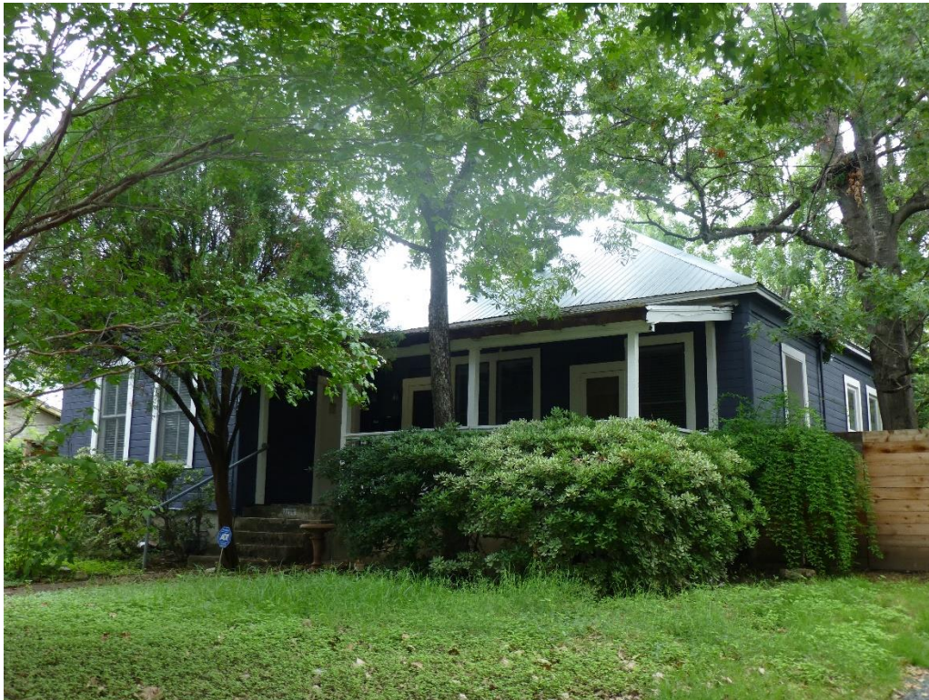
Primary (south) façade and east elevation of 1206 W. 10 th Street.