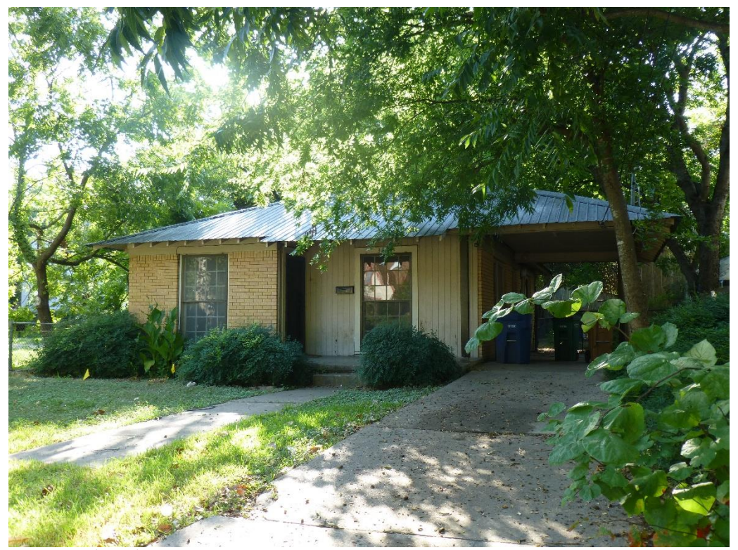
Primary (west) façade of 3401 Werner Avenue.