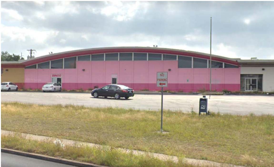
The ca. 1965 Safeway grocery store, 1109 N. IH-35

1105-09 North IH 35 ca. 1965 for 1109 N. IH-35; ca. 1972 for 1105 N. IH-35