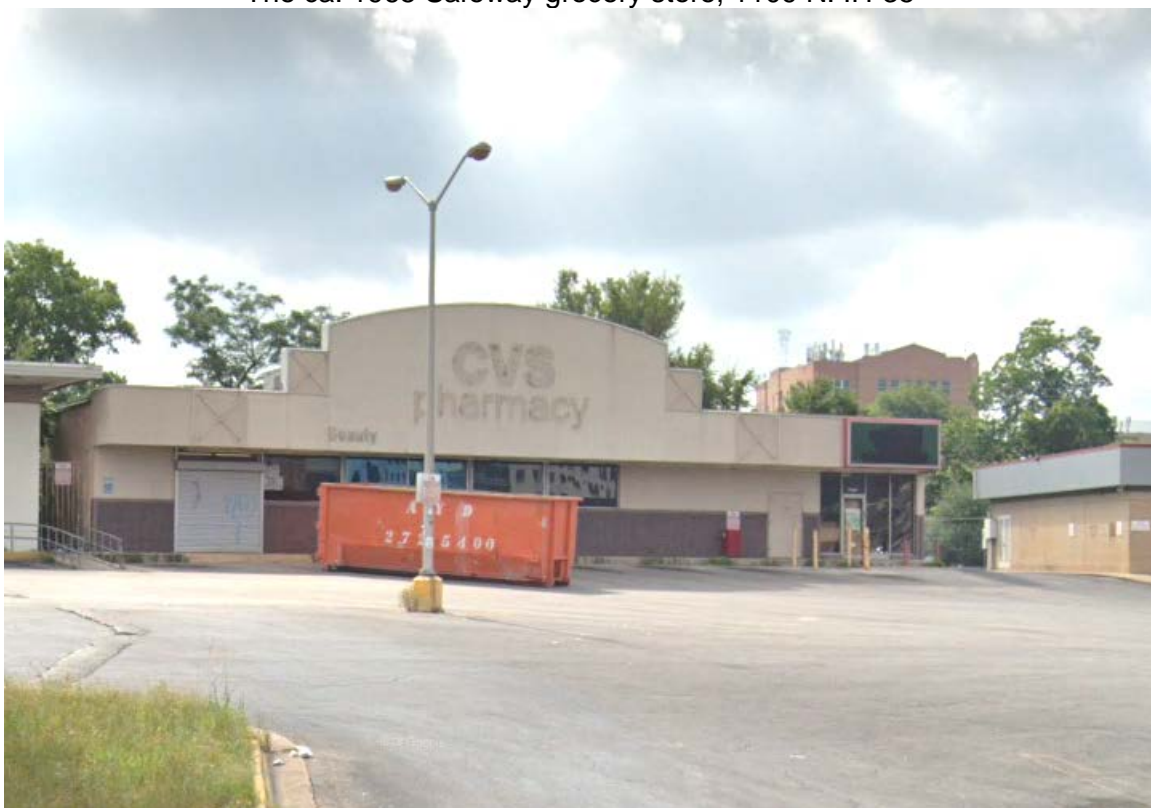
Ca. 1972 Eckerd's Pharmacy (later CVS), 1105 N. IH-35