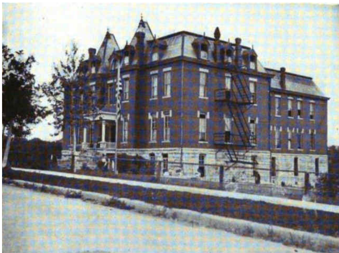
BURROWES HALL, SAMUEL HUSTON COLLEGE