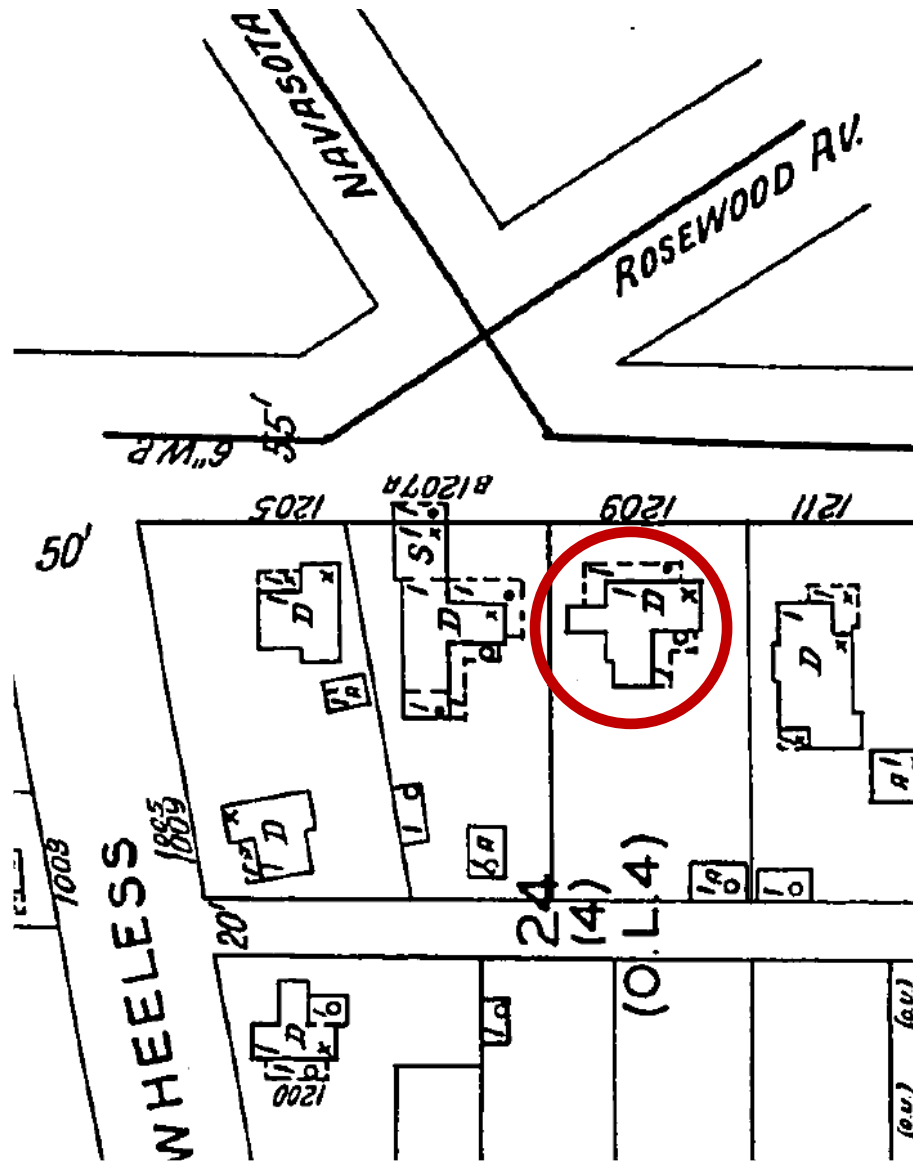
The 1935 Sanborn map shows the original location of Ulysses S. and Veola Young's house. It was moved to the back of the lot in 1949 to make room for the Hillside Drug Store building.