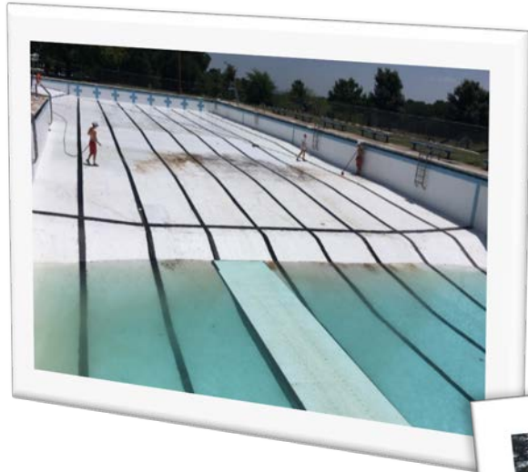
MABEL DAVIS POOL