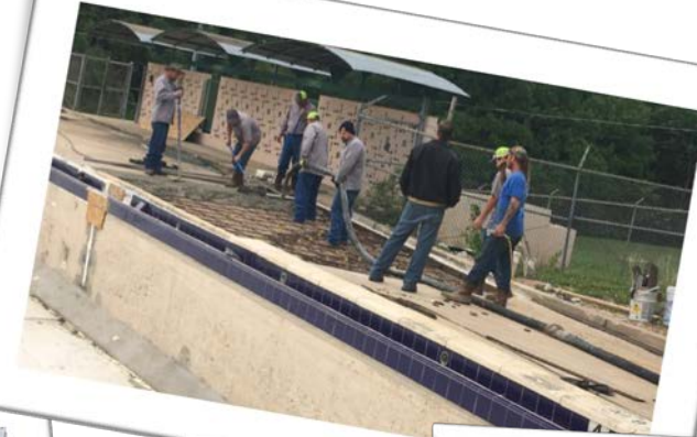
LOTT SPLASH PAD