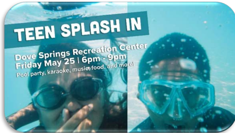
Teen Pool Parties