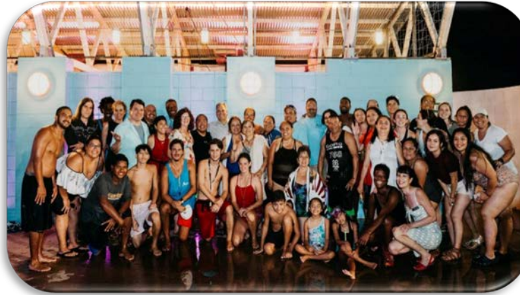
Labor Day Pool Party